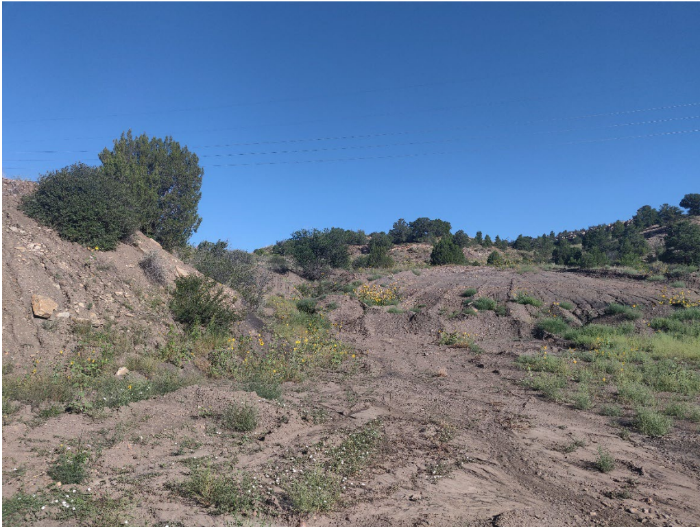
View of the site from the access road looking northwest