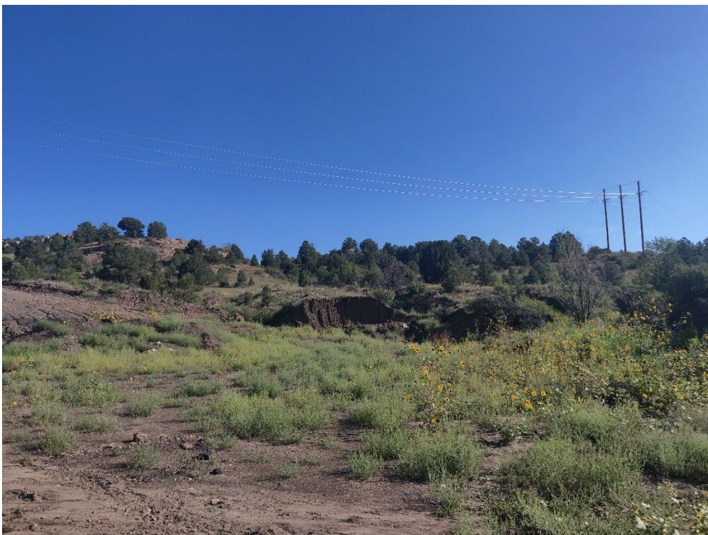
View of the site from the access road looking northeast