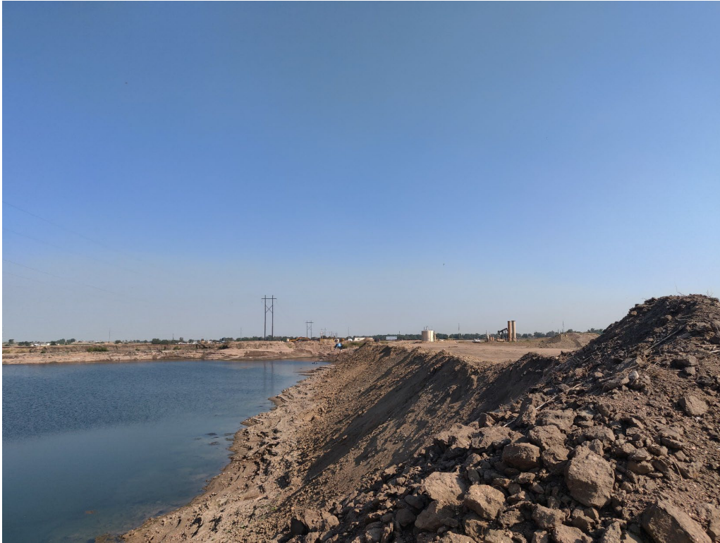
View of the backfilled eastern slope of Phase 2 / Pond 1 Mining Area from the south end looking north