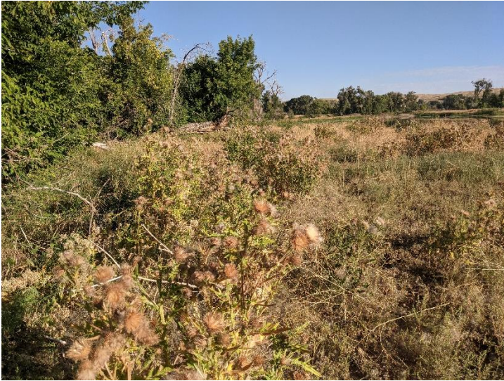
Thistle at western end of pit near entrance.

Several annual weeds were observed thought the pit. The operator is encouraged to more aggressively manage noxious weeds. Thistle and hounds tongue were observed throughout the site most predominantly near the western end of the pit near the mine entrance.