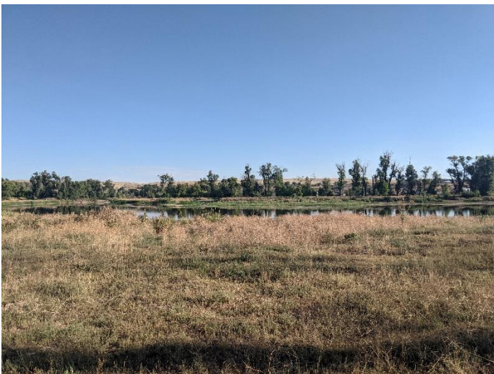
Western extent of pit.

The pit was inactive at the time of the inspection and appeared fully mined through Phase 3 and reclaimed. Pit slopes appeared to have been scaled back to the approved 3:1. The entire pit area was filled with water and vegetation establishment was observed along the banks. The access road along the southern part of pit was roughened and vegetated.