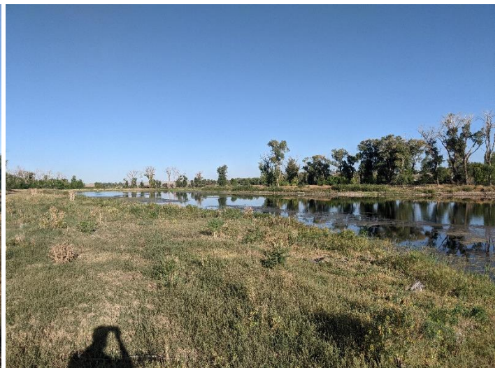
Eastern end of pit looking west.