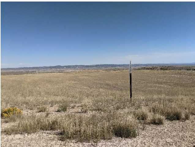
Reclamation in zone 1.

The site as inactive at the time of the inspection. Most of mining zone No. 1 has been reclaimed. Slopes are gentle, blend smoothly and are well vegetated. The overburden and topsoil piles from mining zone No. 1 remain in place. Both stockpiles are stable and vegetated. Two basins exist in zone No. 1 on the north and south side of the topsoil pile. Both basins were dry. Zone No. 2 had large stockpiles staged within the area. No equipment or fuel was located on site.