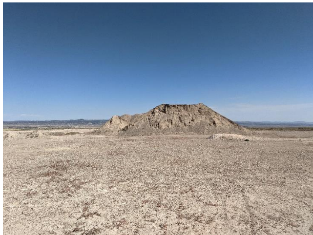
Stockpile in zone 2.