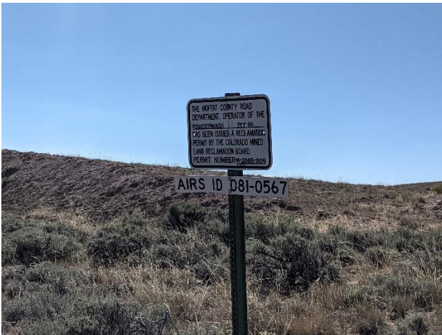
Mine ID sign.

The mine identification sign and affected area boundary markers are in place and in compliance with Rule 3.1.12. Topsoil and overburden piles located on site were marked with designation. Reclamation performed on site was also marked. T-posts were observed marking the perimeter boundary.