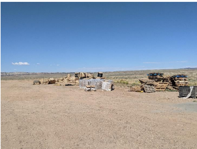
Staw wattles staged.

The site is currently not active with no mining but a crew appeared on site during the inspection. No mining equipment or fuel was on site. The upright water tank for dust suppression remains on site. A truck wash area was observed at the entrance to the site directing all vehicles to wash prior to leaving. Stockpiles of straw wattles were observed along the northern extent of the permit boundary. The wattles were not placed, keyed in, and in use at the time of the inspection. Several large gravel stockpiles remain in the pit.