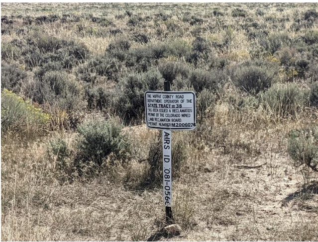
Mine ID sign.

The access road has a locked gate. The mine identification sign and affected area boundary markers are in place and in compliance with Rule 3.1.12. The perimeter was marked with t-posts to clearly delineate permit boundaries. Topsoil and overburden piles were also marked.