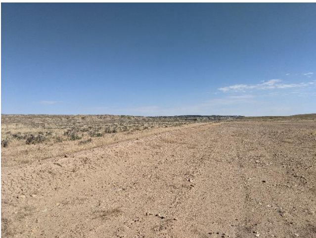
Perimeter containment berm.

The site was inactive at the time of the inspection. No equipment, fuel or structures were present. There were several stockpiles of previously processed material on site. Stockpiled material is stable with no erosion. The sump located adjacent to zone 1 was dry. The entire site was contained by berms. No erosion or issues were observed within the mined area.