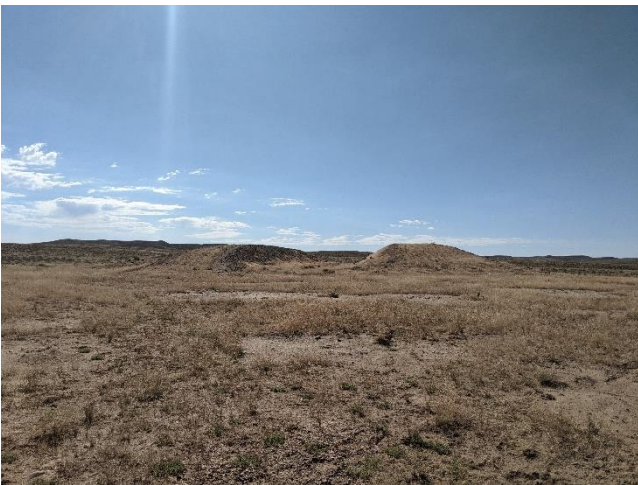
Topsoil and overburden stockpiles.

Topsoil and overburden is stored along the east side of the pit. These stockpiles are stabilized with vegetation. Little to no weeds were observed throughout the site.