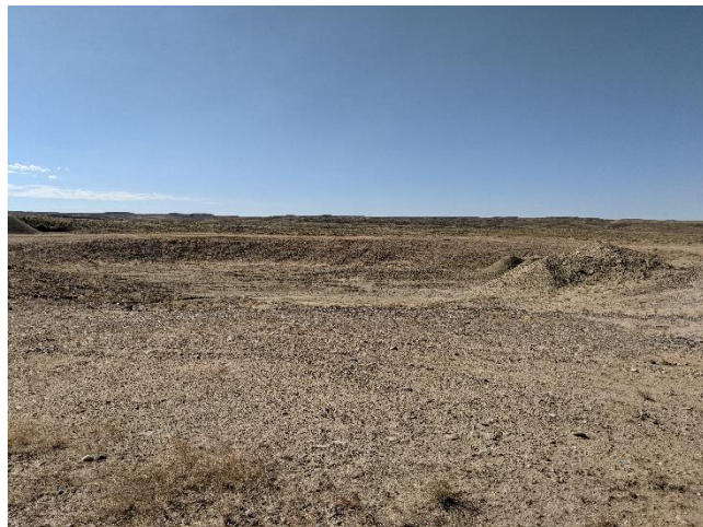
Current pit area.