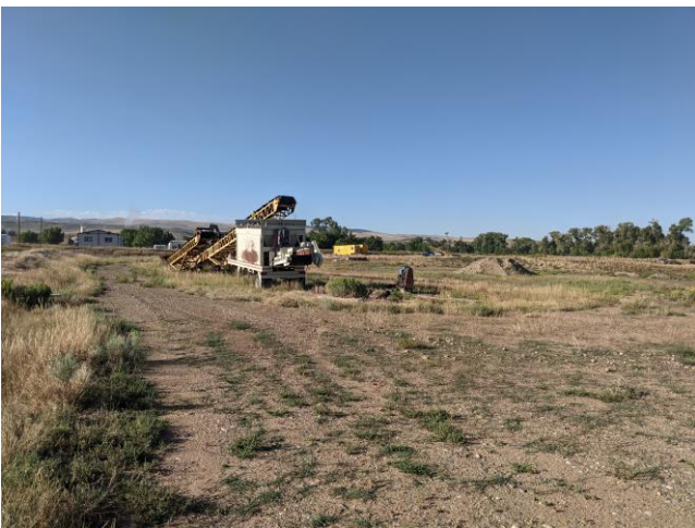
Crusher on site.

The mine was inactive at the time of the inspection. There is no fuel stored on site. No buildings or other permanent structures have been erected. A crusher and excavator were located on site but the only equipment. There is one small stockpile in the pit and area. No overburden and topsoil stockpiles were observed on site that were noted on previous inspections.