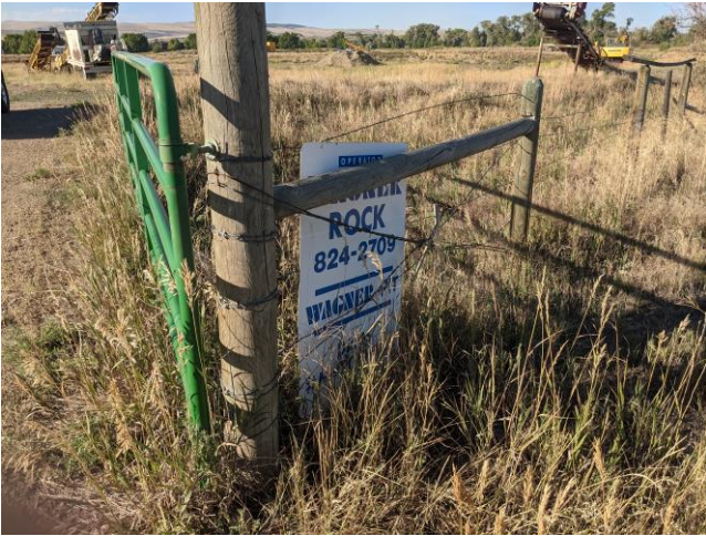
Mine ID sign.

The mine identification sign and affected area boundary markers are in place and in compliance with Rule 3.1.12. The sign is located at the entrance and the entire permit boundary is fenced in.