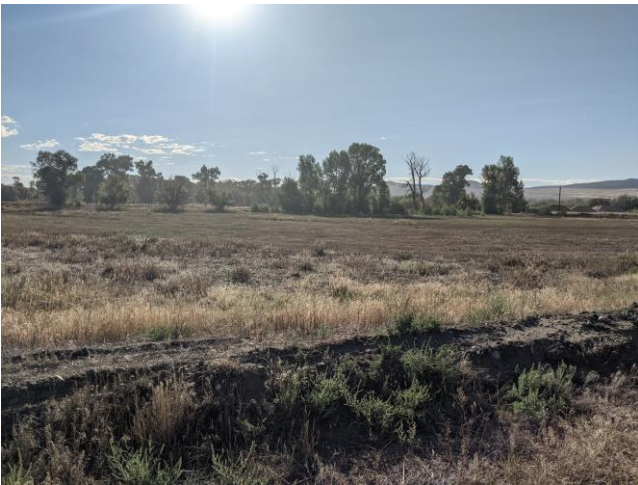
Eastern portion of permit.

The eastern half of the pit remains undisturbed. It is separated from the active pit area by a berm and is stabilized with well-established grasses. Discussion with the operator prior to the inspection stated that weed spraying had occurred prior to the inspection. No noxious weeds were encountered on the inspection.