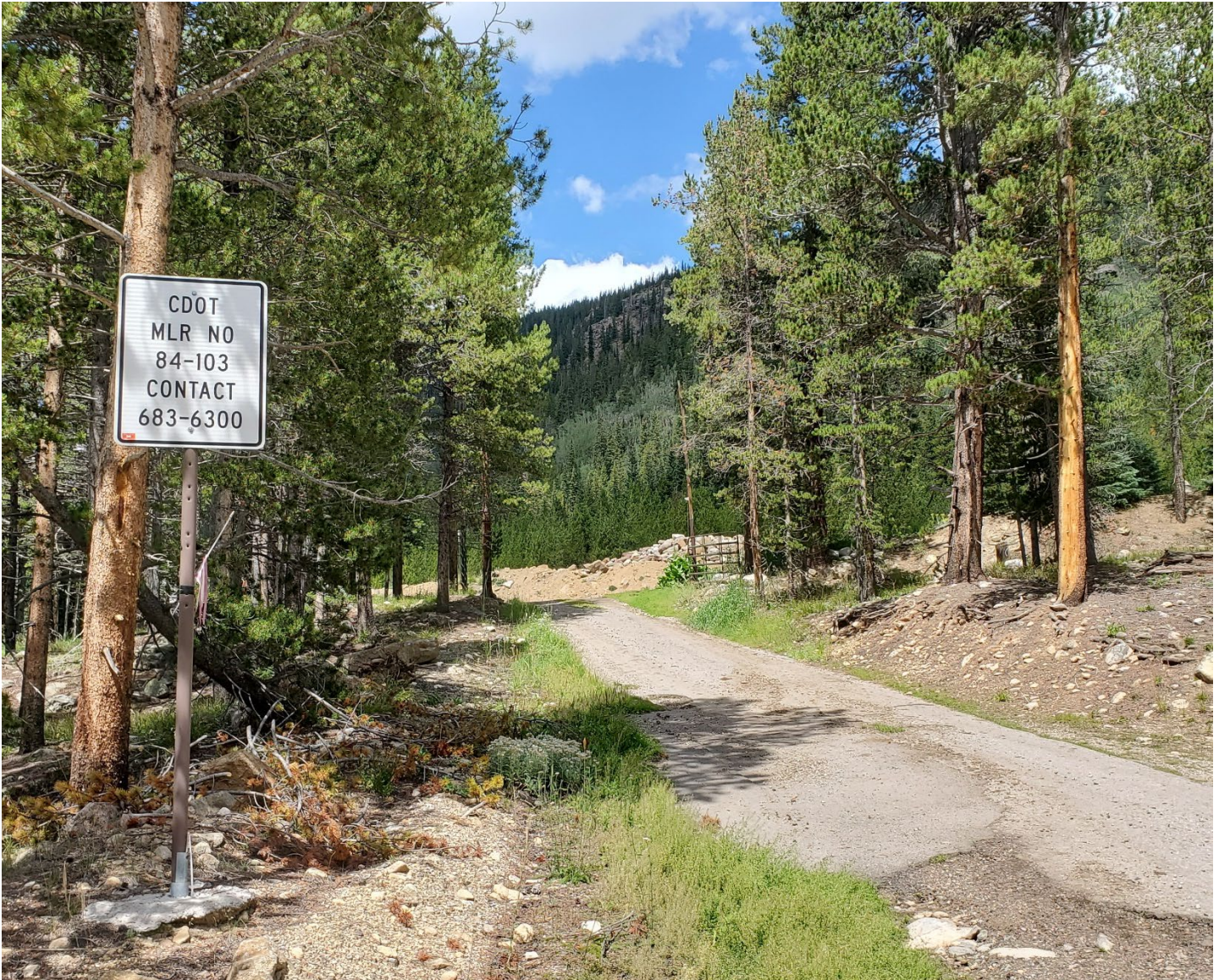
Figure 8: Site entrance and ID sign

Jered Morgan Colorado Department of Transportation 606 S. 9th. Street Grand Junction, CO 81501