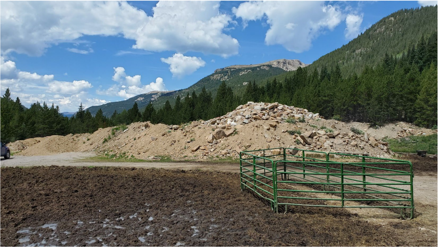
Figure 6: Stockpiled material in background, with horse paddock in foreground (E)