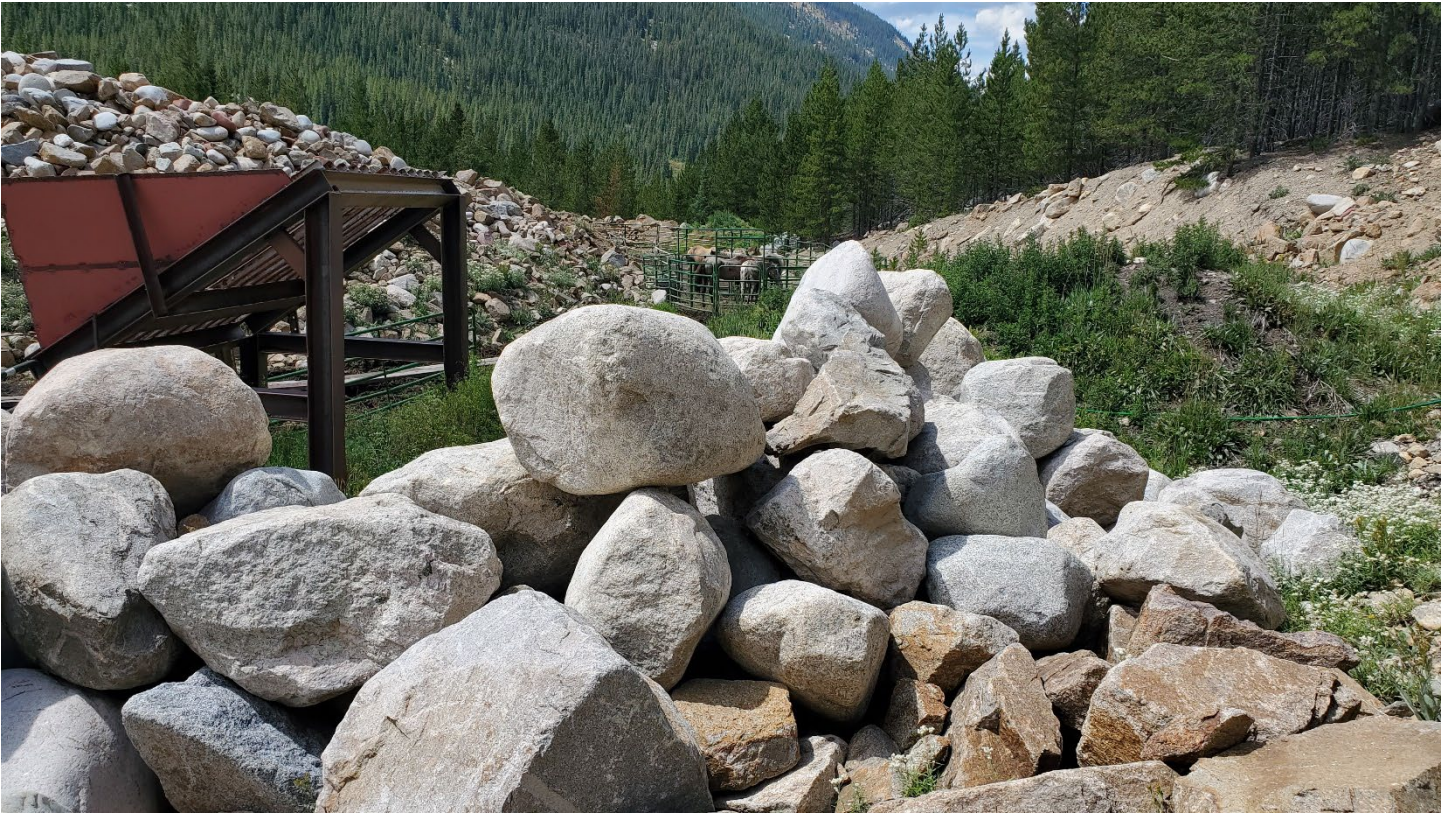
Figure 4: Stockpiled boulders and screen (C)