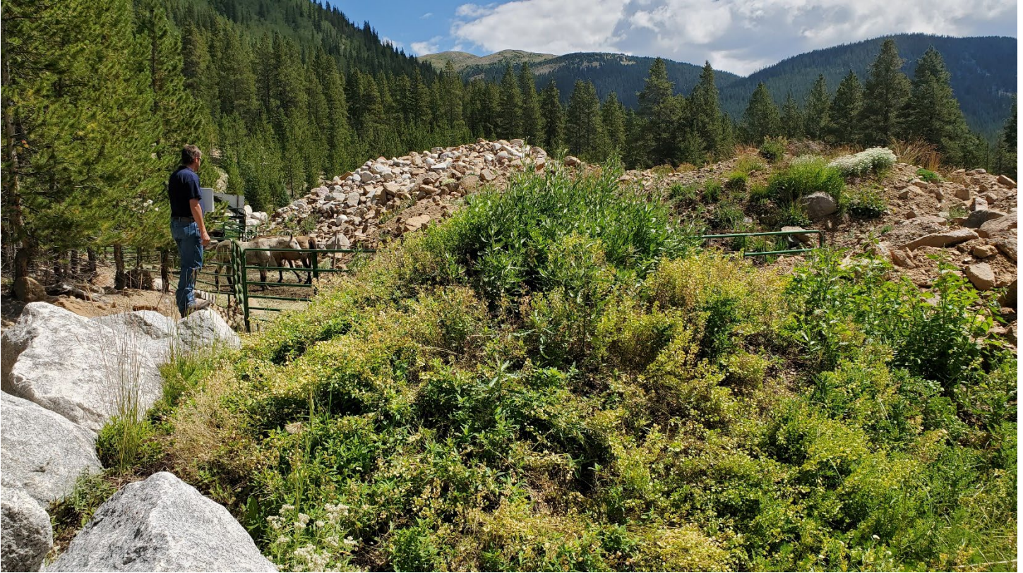
Figure 2: Location of CDPS outfall (A)