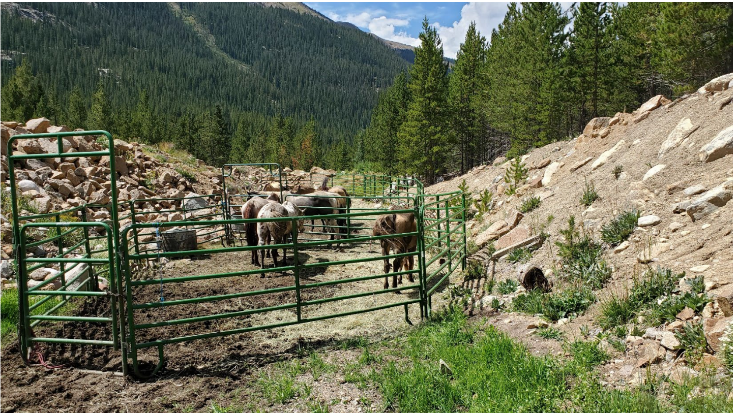
Figure 3: Horse corral (B)