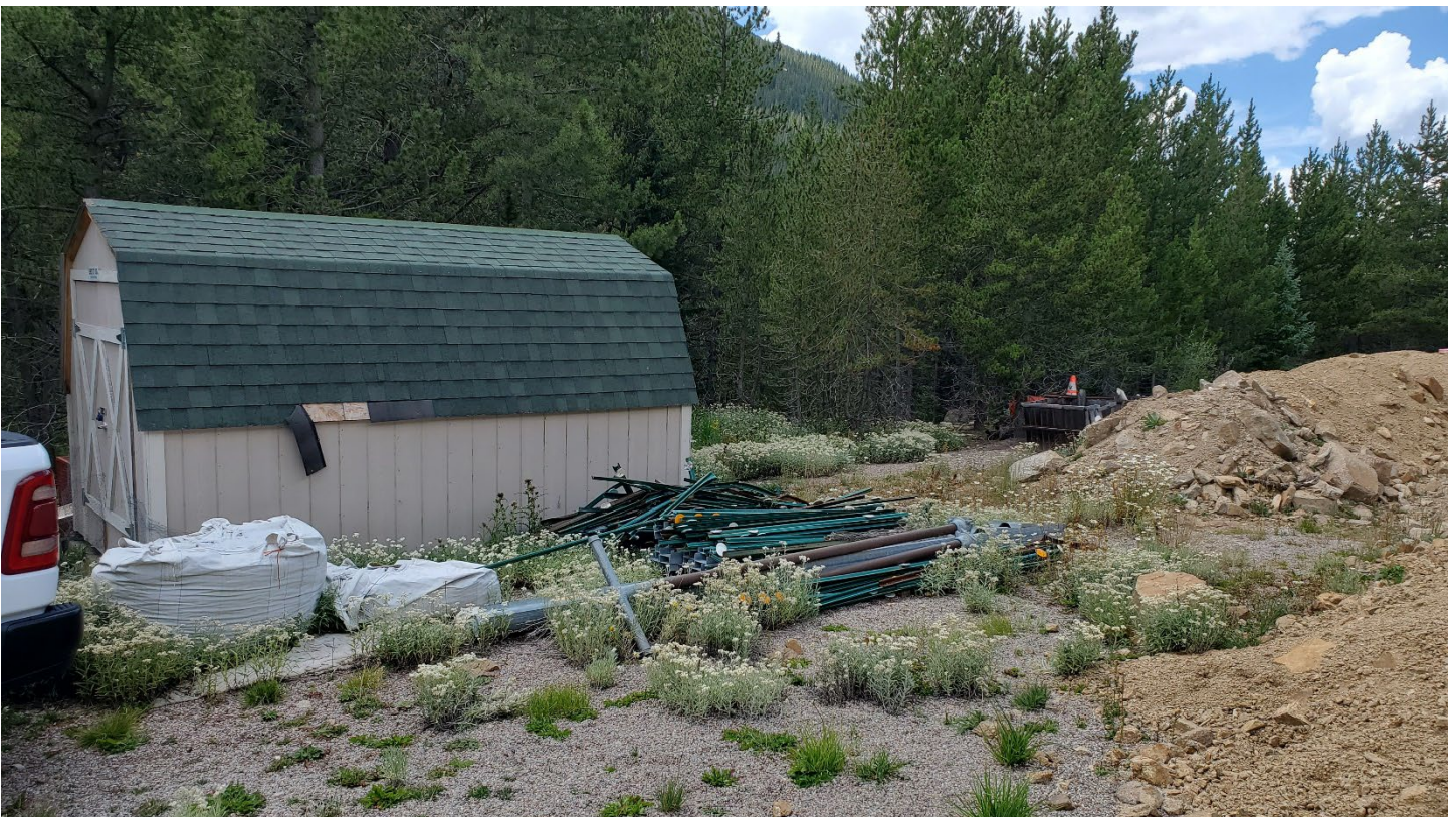
Figure 7: USFS shed and materials