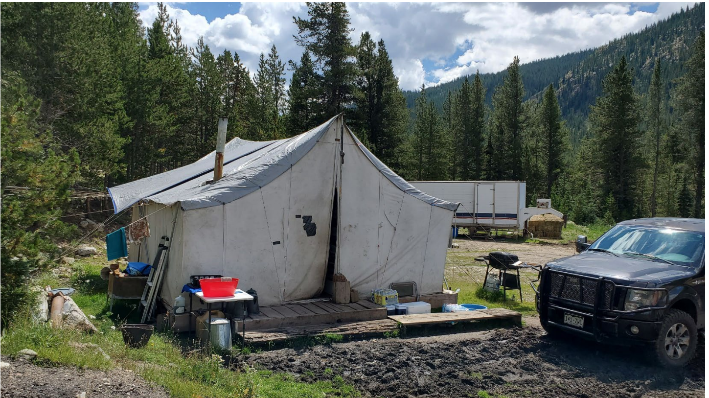
Figure 5: Outfitter's camp (D)