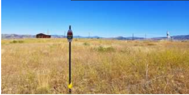
NW corner proposed to be removed, looking north from pipeline marker.