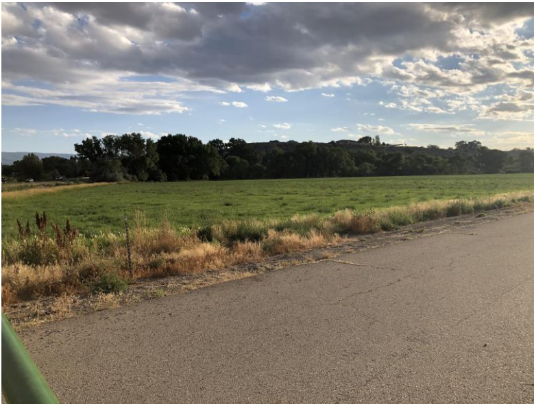
Area of proposed expansion, north side