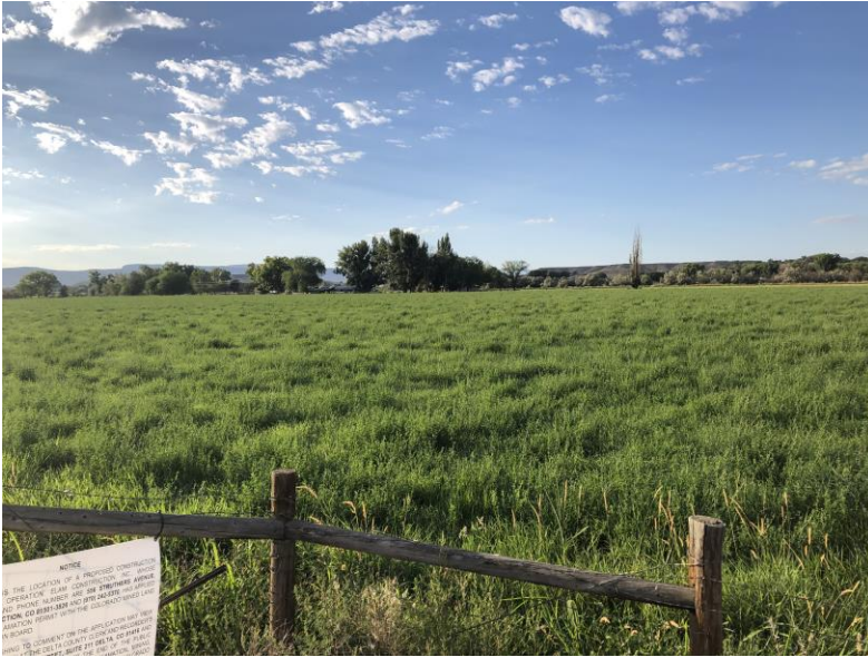
Area of proposed expansion, south side