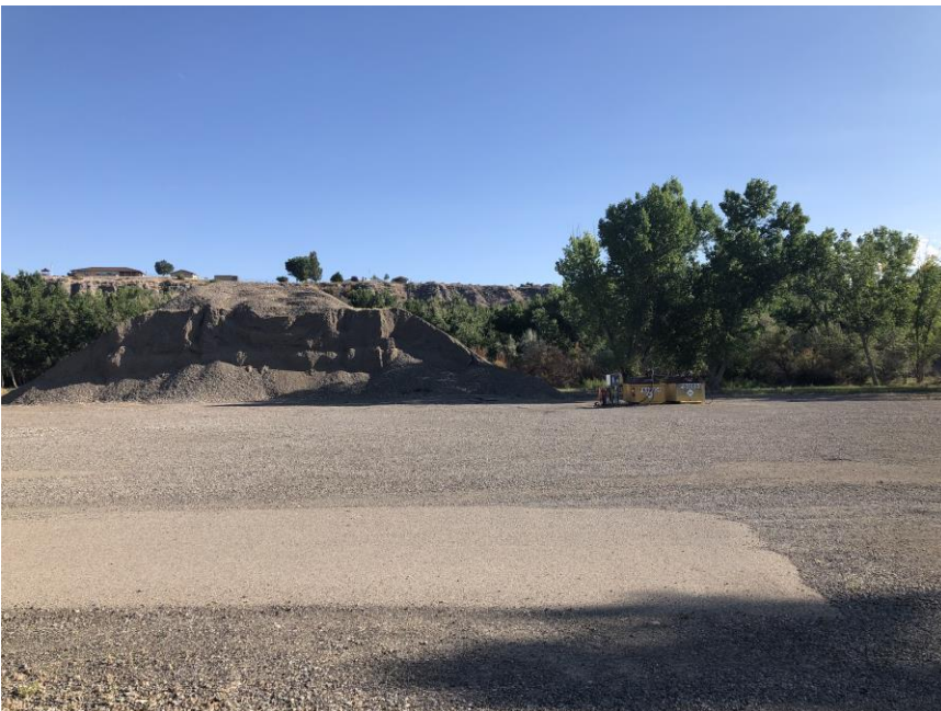
Facility area with product storage and fuel tanks with secondary containment