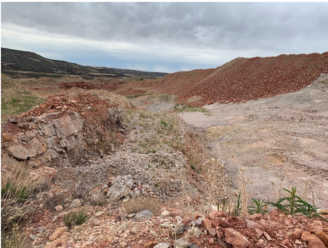
Photo 4 – North pit area facing east, highwall on left contains runoff.