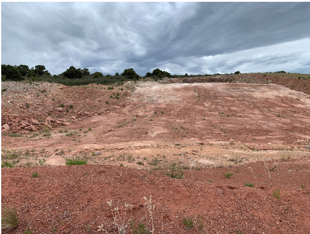
Photo 2- Phase VI pit area on south side of access road.