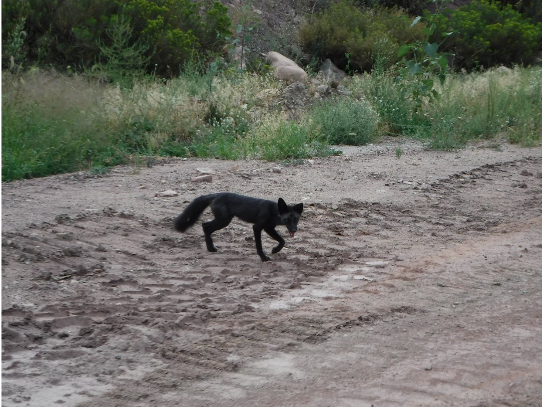
Photo 5: Wildlife present at the site during reclamation activities