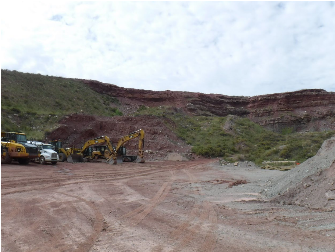
Photo 6: Quarry 1 in the background and the pond has been backfilled and was located under stockpile to right of photo