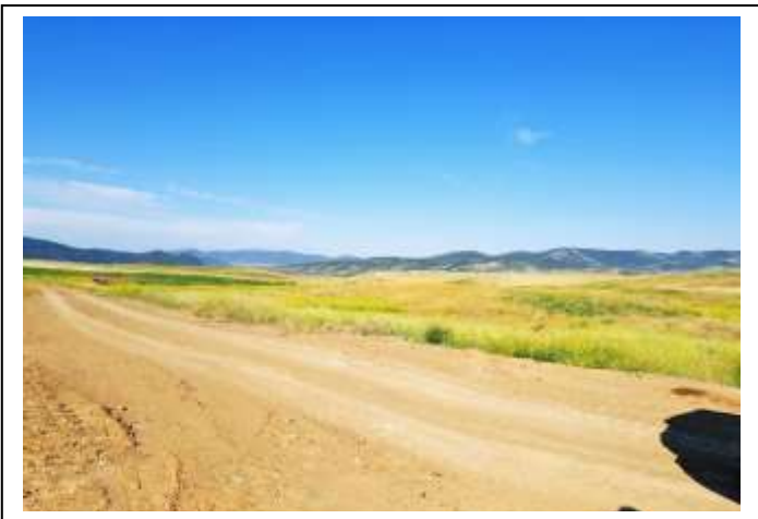
Access road to disturbed area