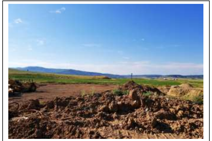
Overview of the remaining disturbance with reclaimed area in background, which are well established alfalfa fields