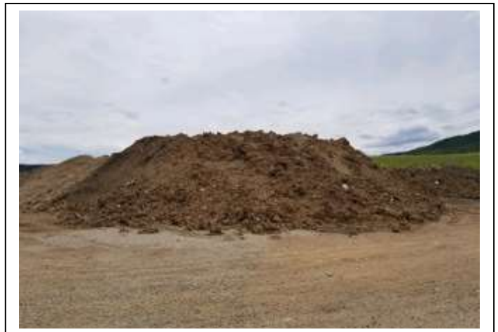
Stockpile material in South pit