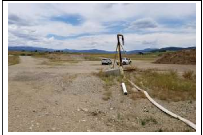
Pit floor, product stockpile and reclamation material pile