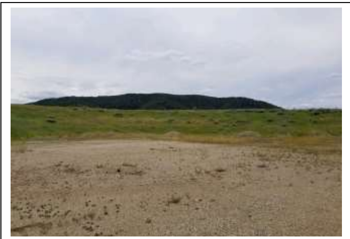
Reclaimed slope, recently sprayed for weeds