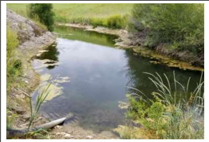
Pond at edge of South pit