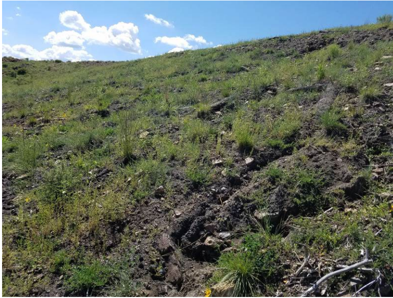
Figure 1. Slope above the sediment storage pile.