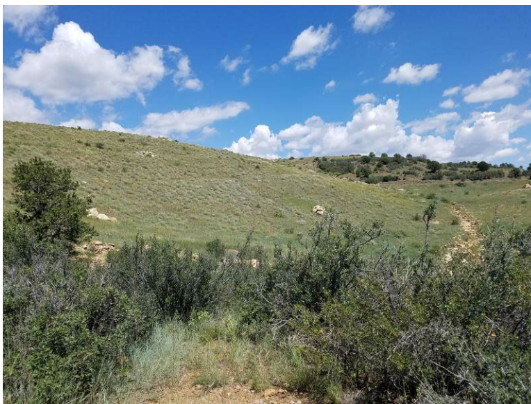
Figure 6. Fill 9

Number of Partial Inspection this Fiscal Year: 2