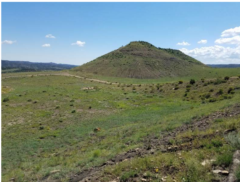
Figure 3. View of the Knob from above the sediment storage pile.