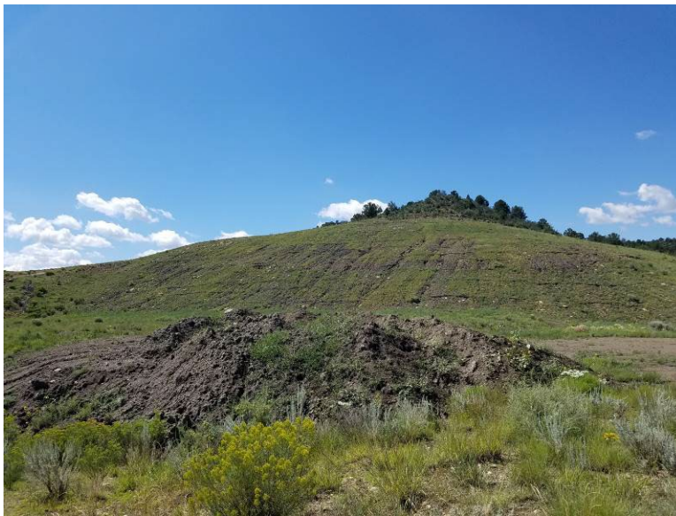
Figure 2. Slope above sediment storage pile.

Number of Partial Inspection this Fiscal Year: 2