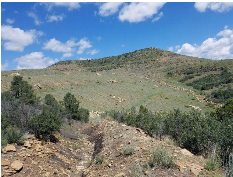
Figure 5. Fill 7