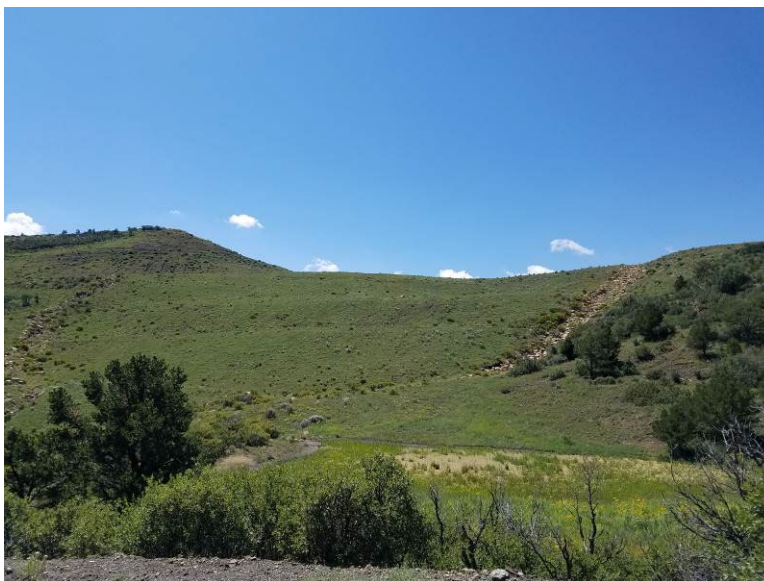
Figure 4. Fill 8.

Number of Partial Inspection this Fiscal Year: 2