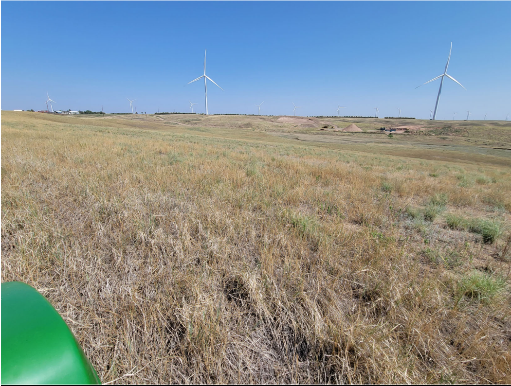
Looking north along the western slope of the permit area. Area reseeded in 2017.