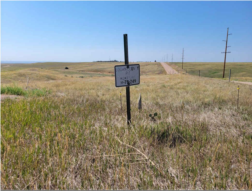
Looking south at mine sign posted at the entrance to the pit.