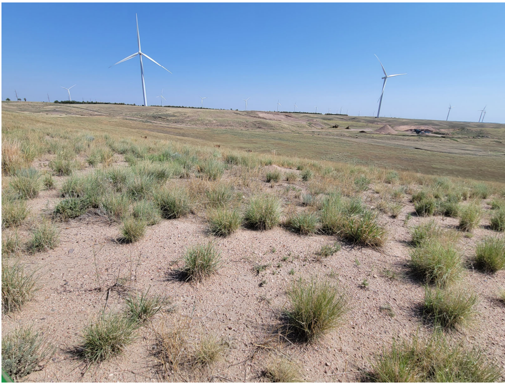
Small area of patchy grass on the top of the western slope, reseeded in 2017.