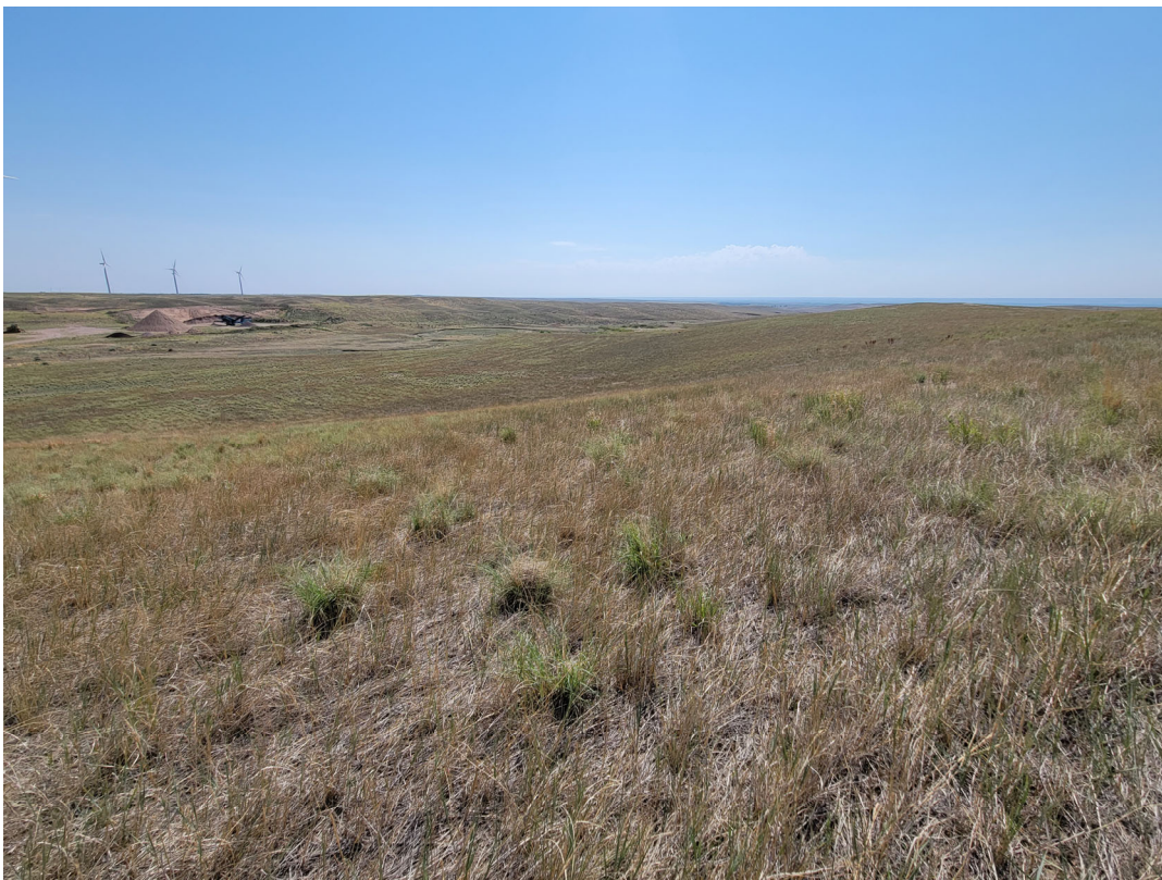
Looking southeast from the western slope of permit area.