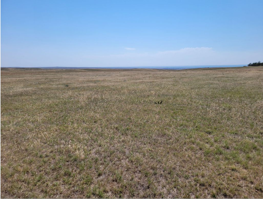
Looking south near the entrance to the permit area.