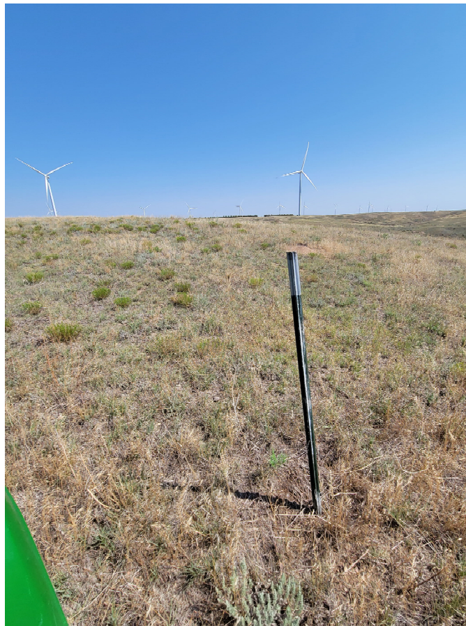
Northern permit boundary marker.