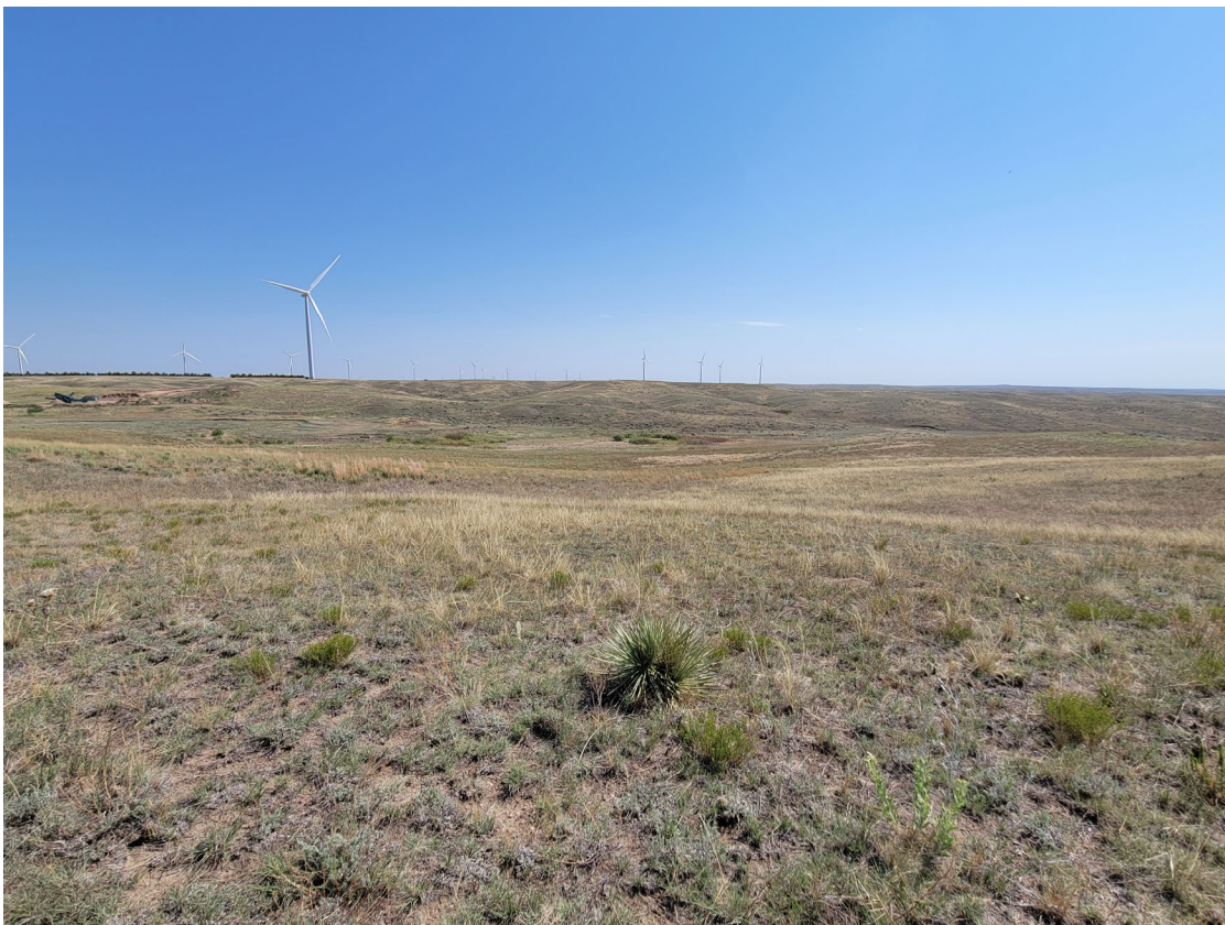
Looking east across the permit area.