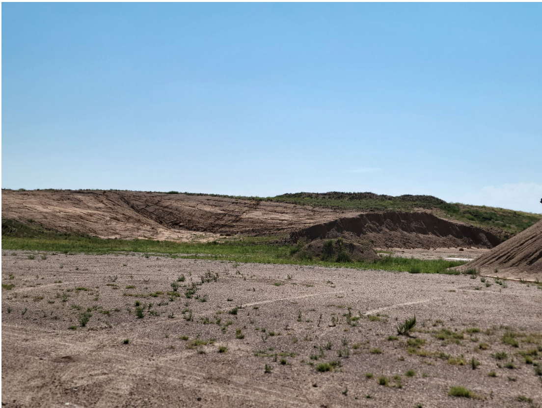
Looking northeast at the eastern highwall.