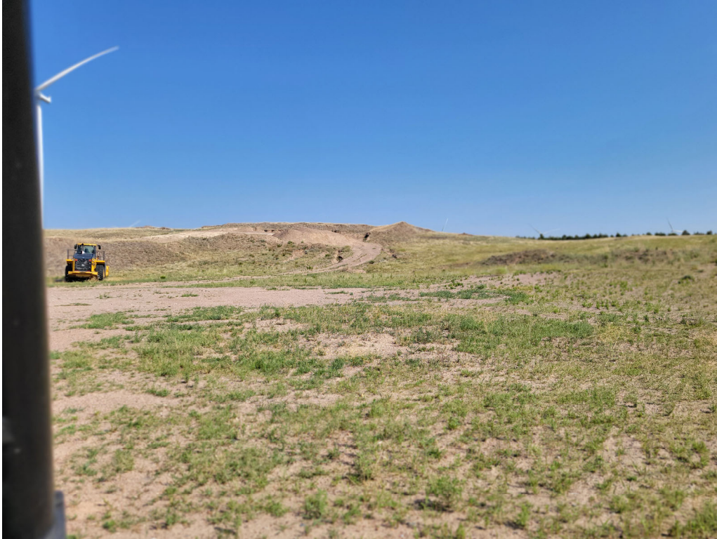
Looking northwest at the western highwall.

MMM Partnership, LLP. 36366 Cty Rd. 79 Crook, CO 80726