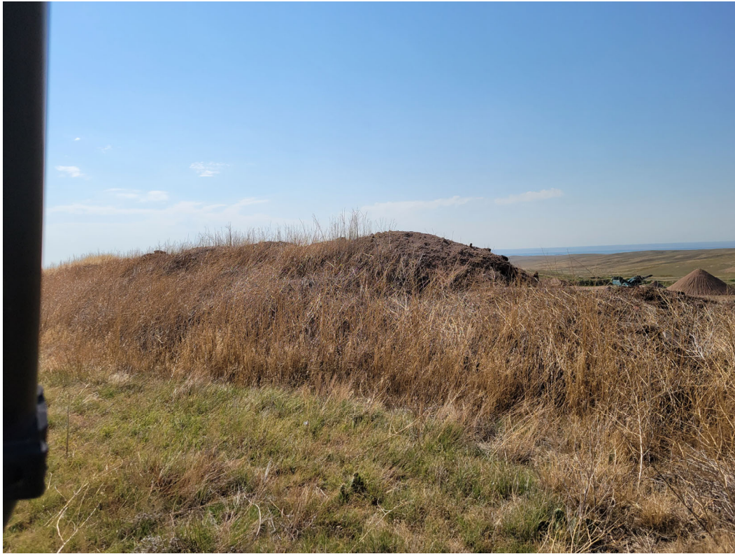
Topsoil stored above the pit along the northern permit boundary.