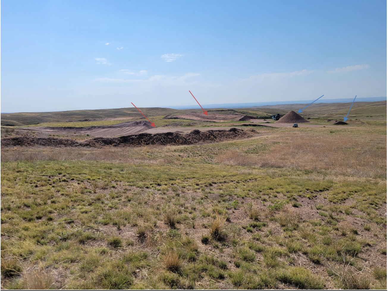
Looking southeast across the permit area. Red arrows point to the two areas of active mining. Stockpiles are marked by blue arrows.