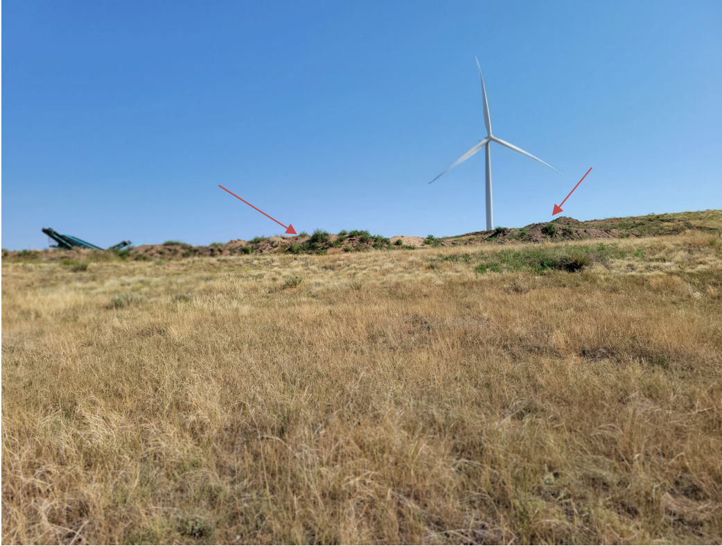
Soil berms keeping sediment and runoff within the pit area.