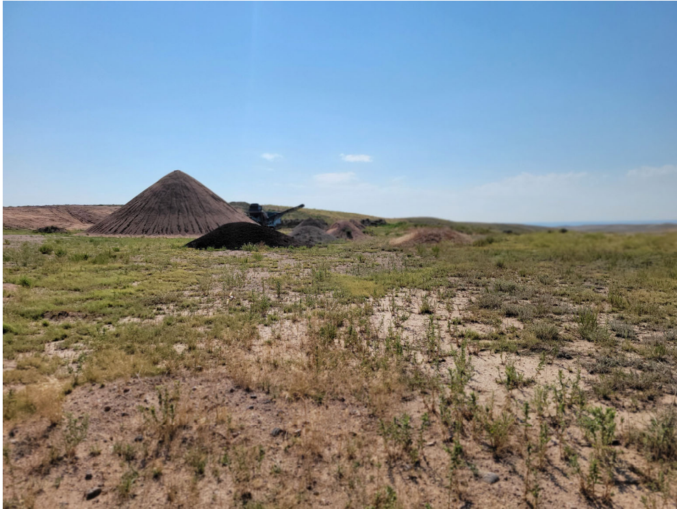
Stockpiled product and mulch in the bottom of the pit area.