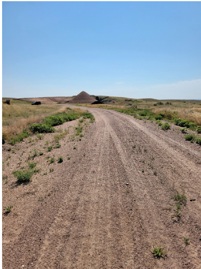
Gravel access road into pit.