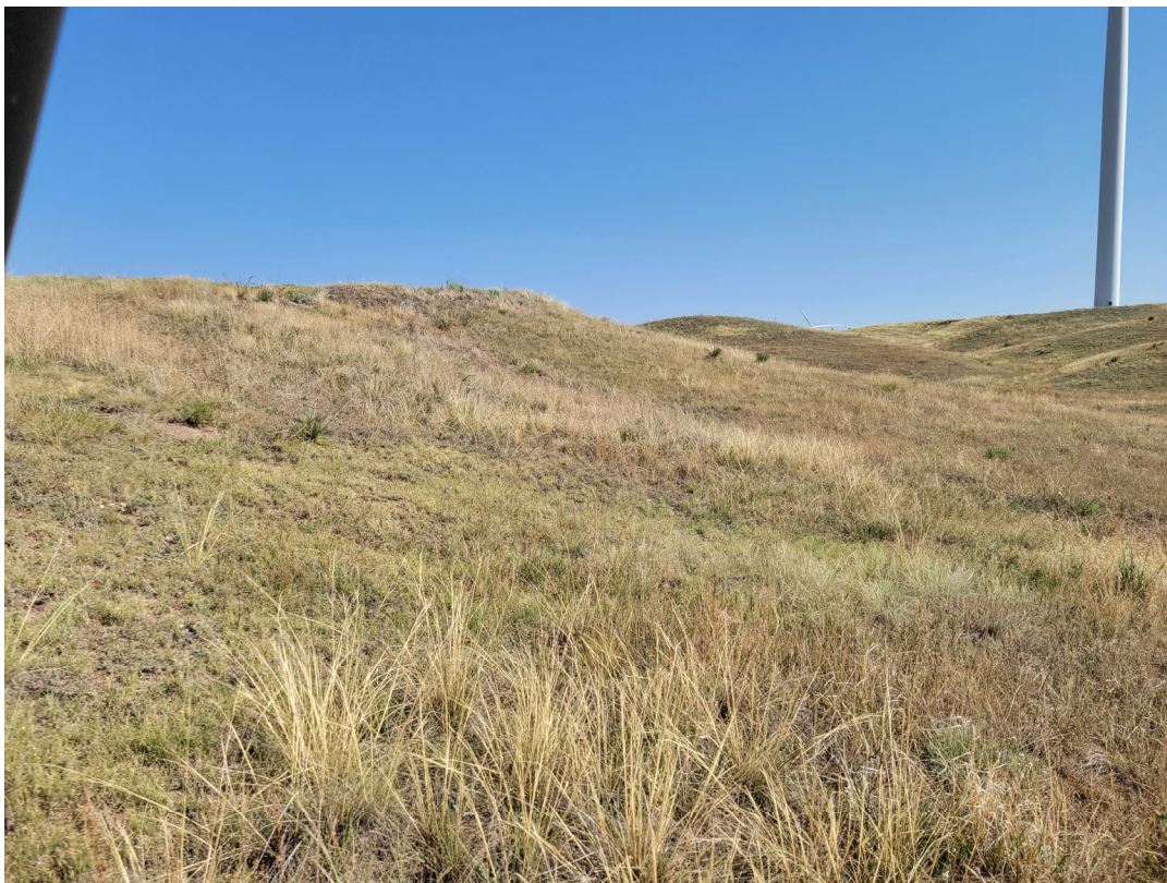
Previously disturbed and reclaimed slopes.