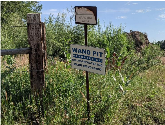
Mine ID sign.

The mine identification sign and affected area boundary markers are in place and in compliance with Rule 3.1.12.