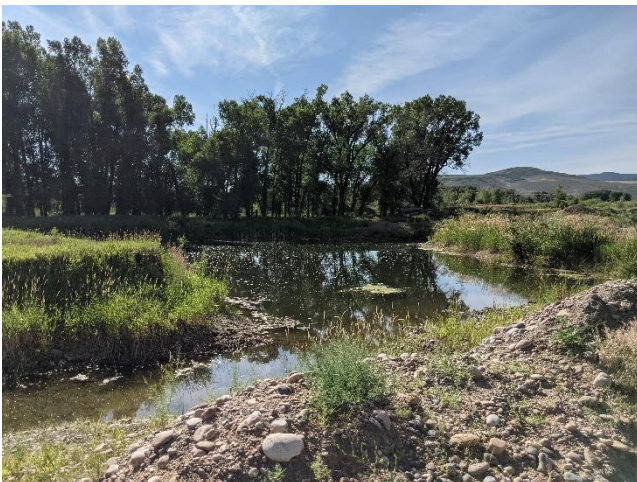
North eastern pond.

The site was inactive at the time of the inspection. No processing equipment was observed on site along with no fuel, equipment, trailers, etc. The only thing observed on site were staged culverts. Some material remained stockpiled along the southern excavated pond. There are currently two excavated areas both holding water with mining still within phase 1. The two excavated areas are connected by culvert two dewater the pond located north east of the current boundary.