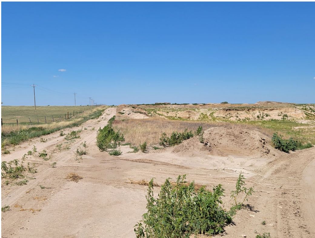
Looking west from the entrance, road and fence line run along the southern edge of permit area.