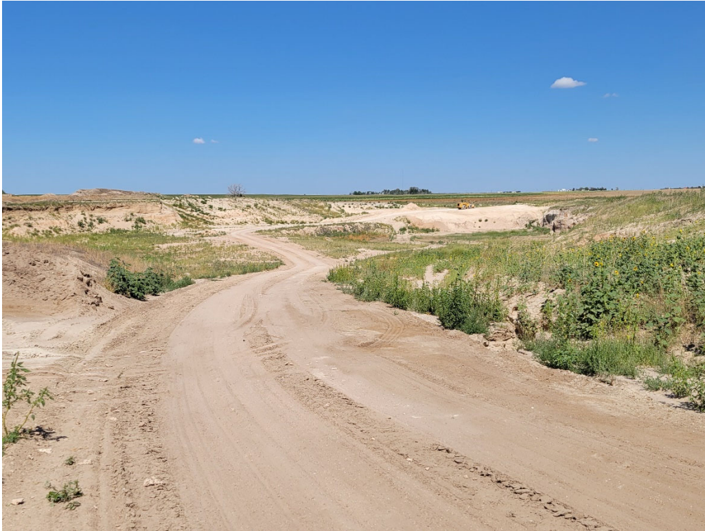
Looking northwest from the entrance to the pit.