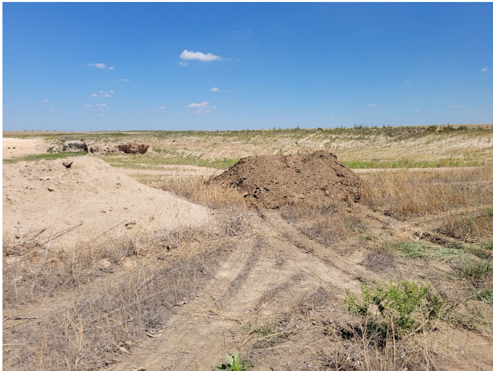
Looking east from the southern access road. Soil pile, dumped from truck during inspection.