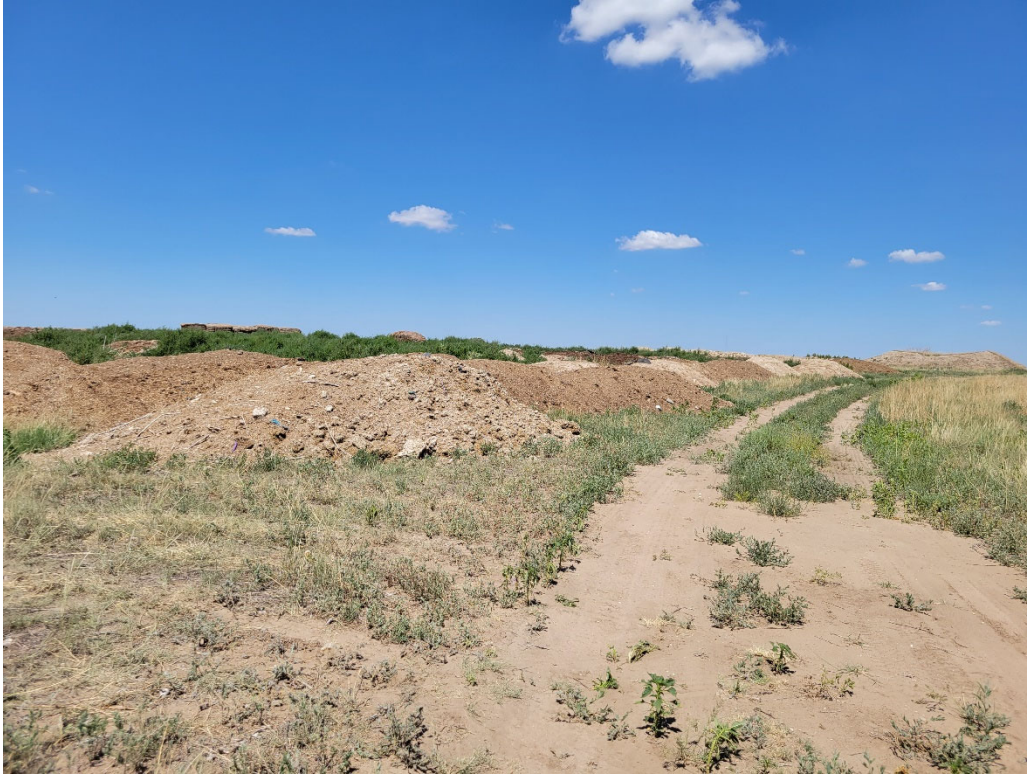
Looking east from the western tip of disturbance, soil/mulch piles stored above the pit for future reclamation.