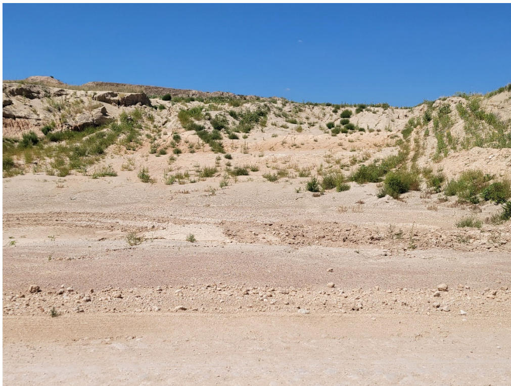
Looking northwest at the highwall. No recent disturbance noted.