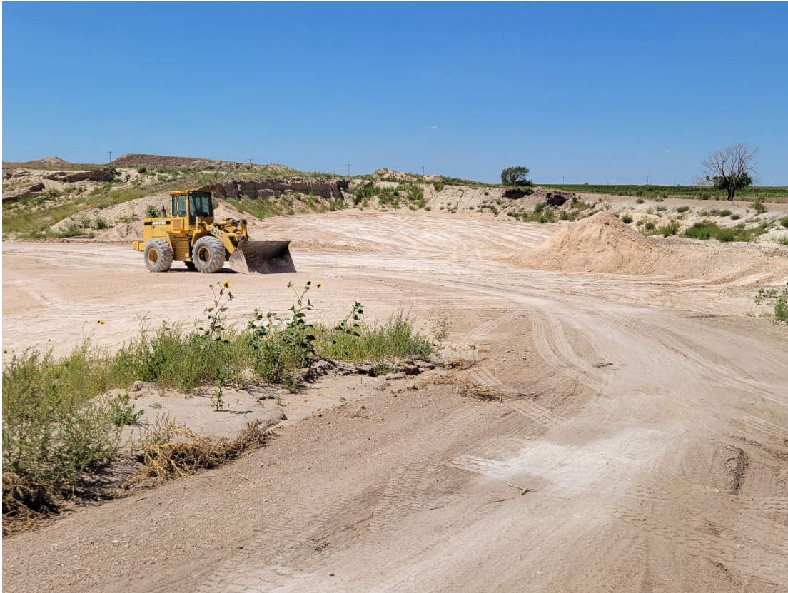
Looking west across pit. Stockpiled material for loading in the northern center of the pit.