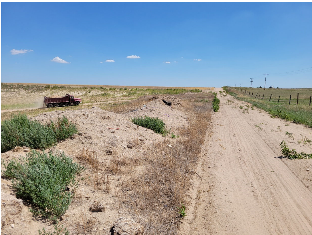
Looking east at dump truck taking material from the site. Piles of soil and mulch stored along road.