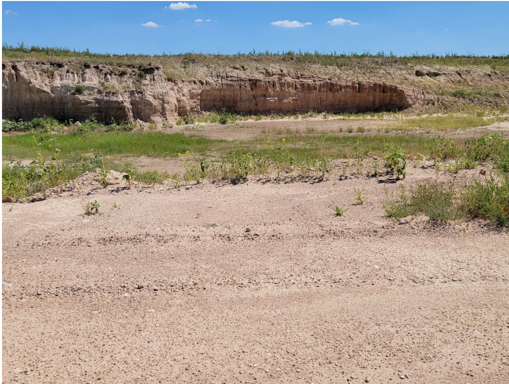
Looking east at the vertical highwall. Water collects at the base of this wall during heavy rain and infiltrates into the ground.