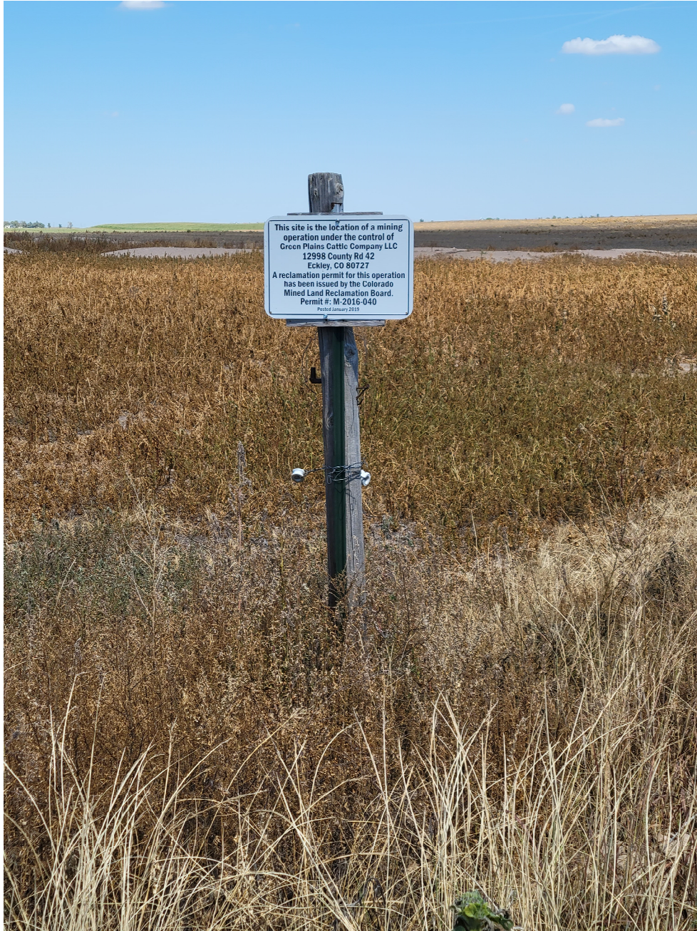
Mine sign posted at the entrance, shows Green Plains Cattle Company, LLC as the operator.