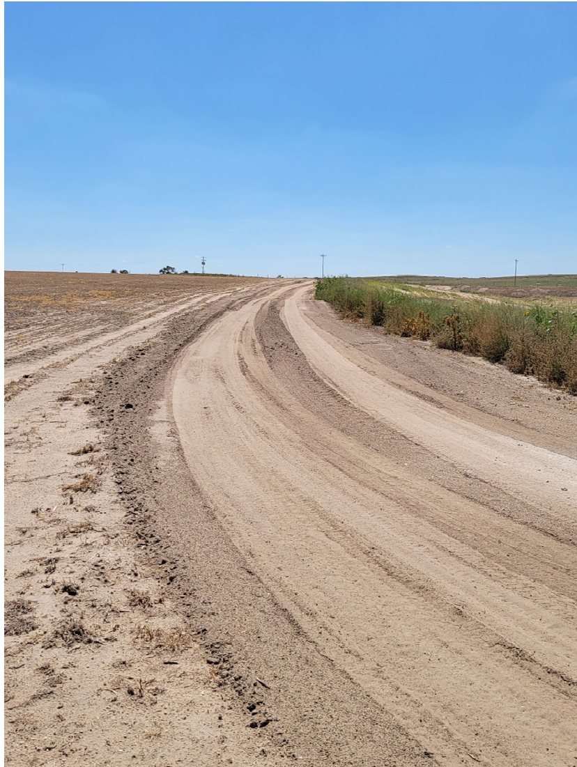
Looking southeast along road used by dump truck to access pit. Road delineates area of mining disturbance from the farm operation to the east.