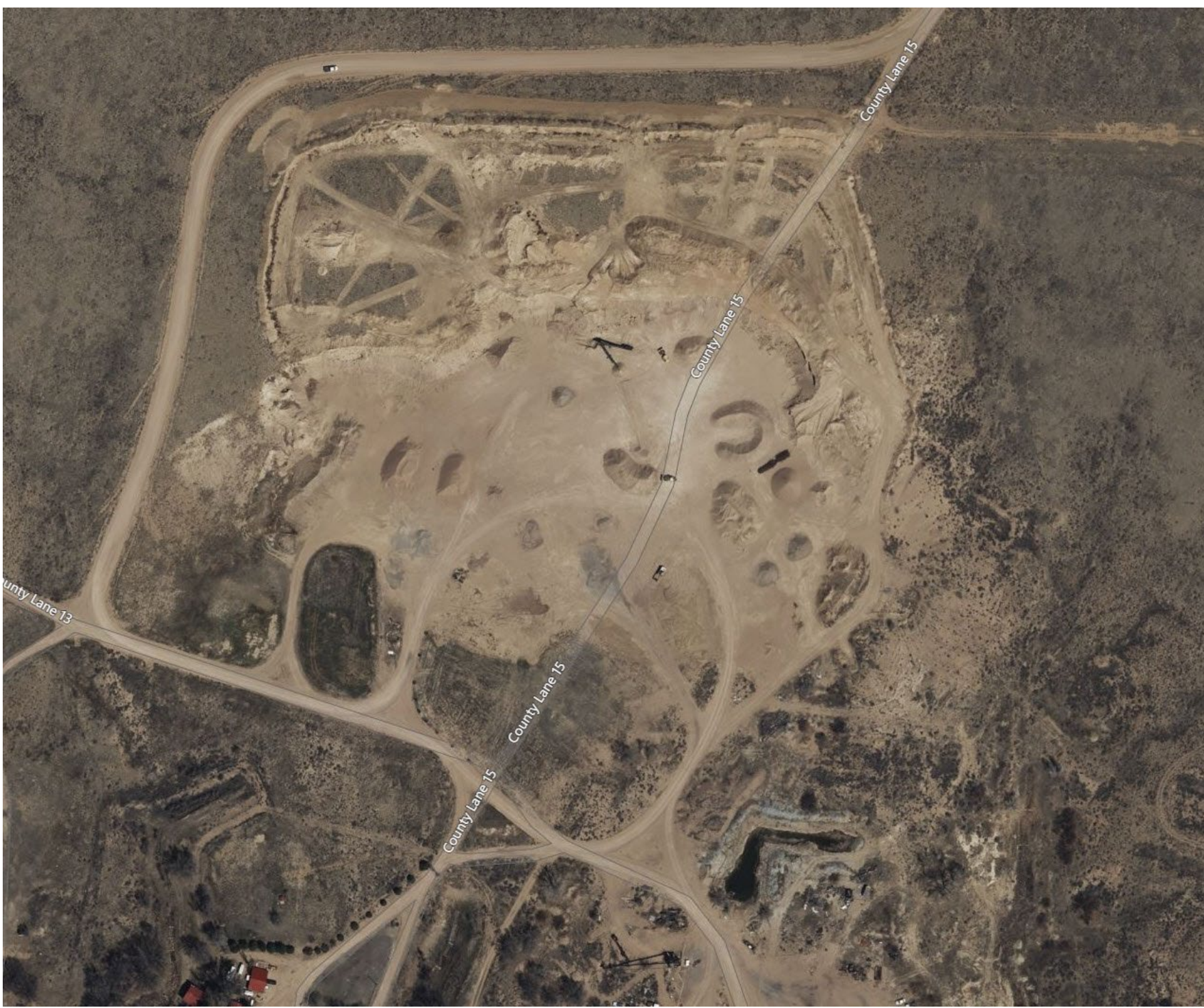
Recent aerial image noting disturbance along County Lane 15