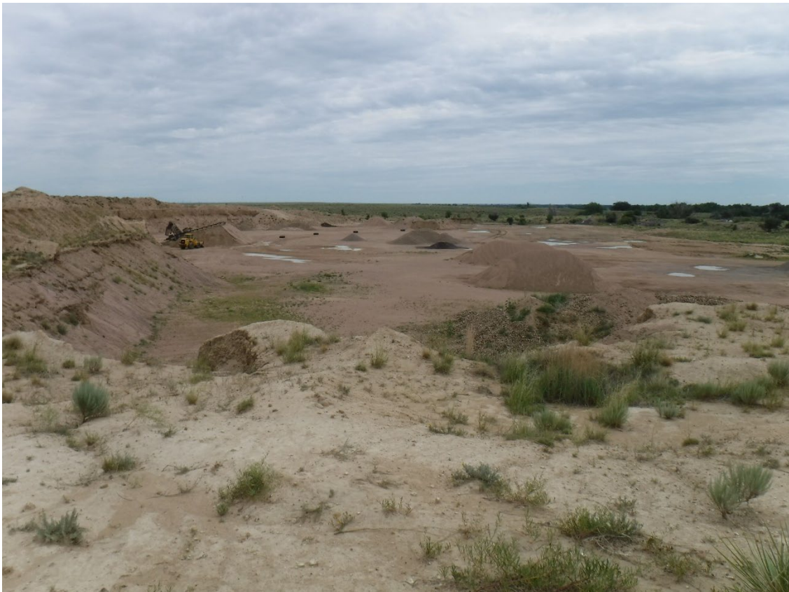
Photo 8: Looking east across the pit floor area, approximately 8 acres