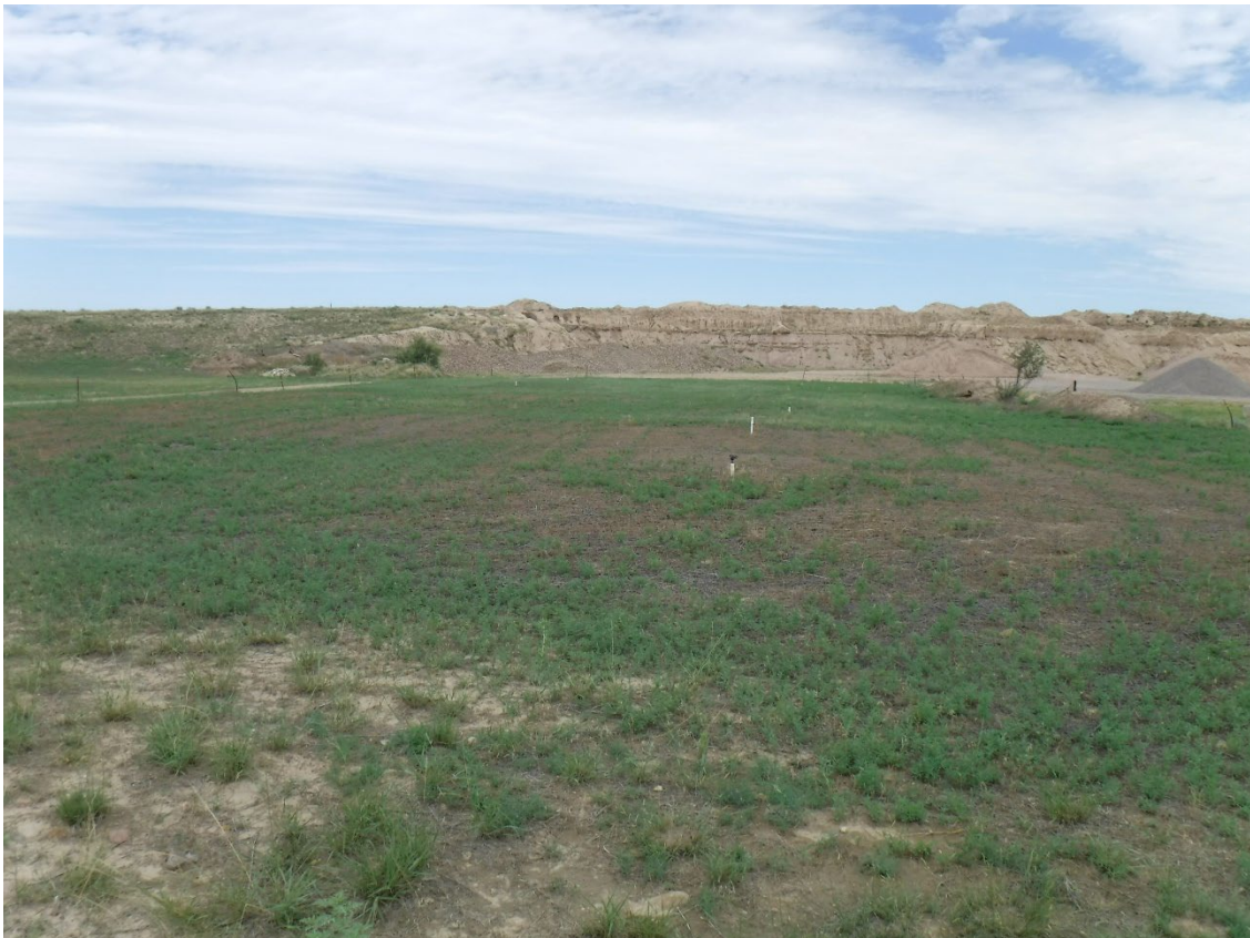
Photo 4: An area immediately west of mine sign, 0.67 acres, in reclamation