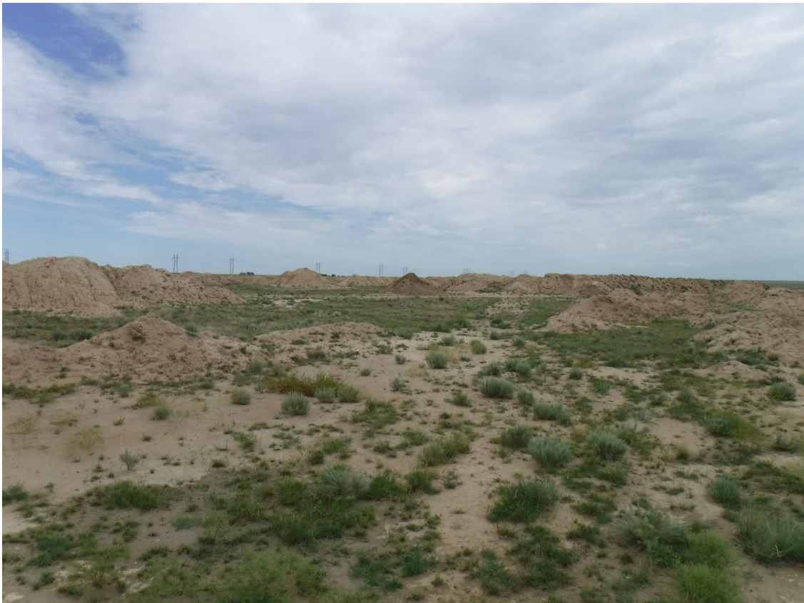
Photo 10: The disturbed area, approx. 6.6 acres, north of pit highwall