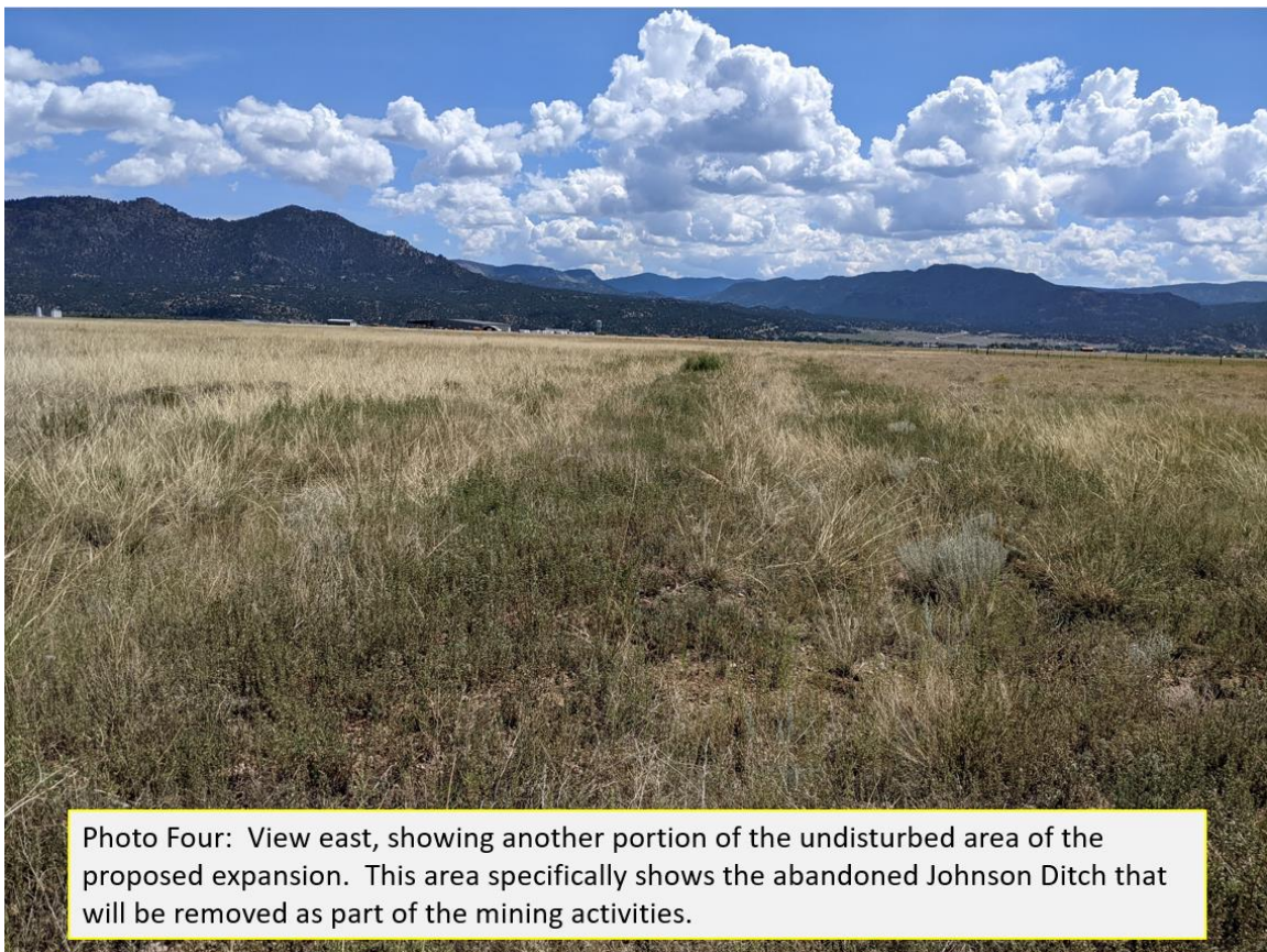
Photo Four: View east, showing another portion of the undisturbed area of the proposed expansion. This area specifically shows the abandoned Johnson Ditch that will be removed as part of the mining activities.