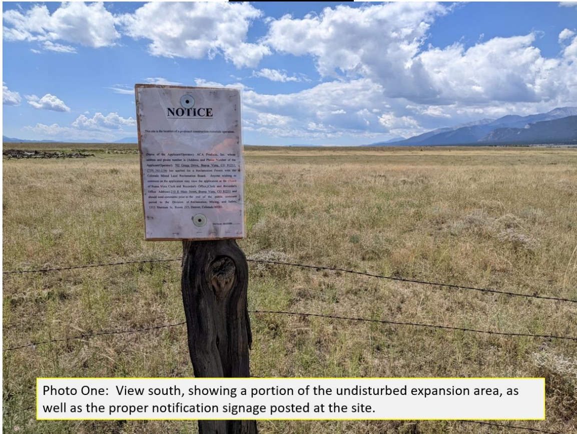
Photo One: View south, showing a portion of the undisturbed expansion area, as well as the proper notification signage posted at the site.