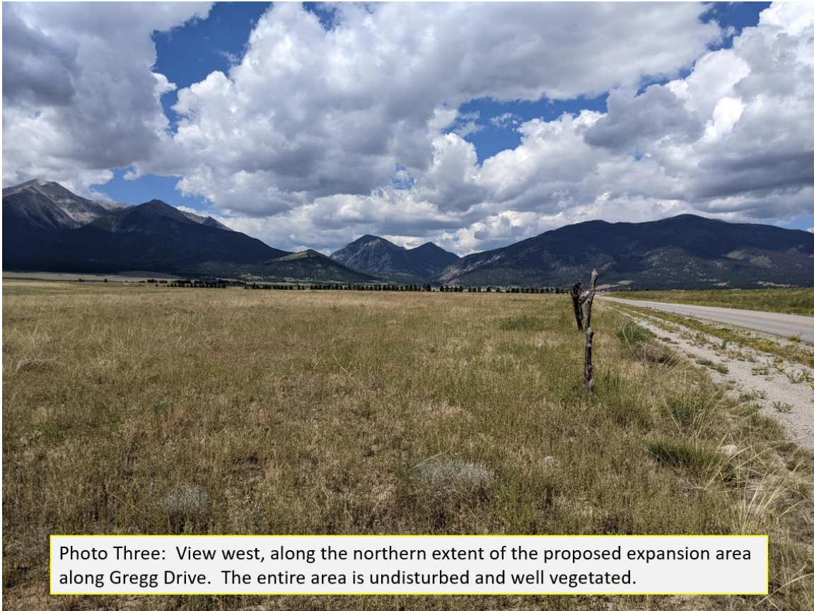
Photo Three: View west, along the northern extent of the proposed expansion area along Gregg Drive. The entire area is undisturbed and well vegetated.