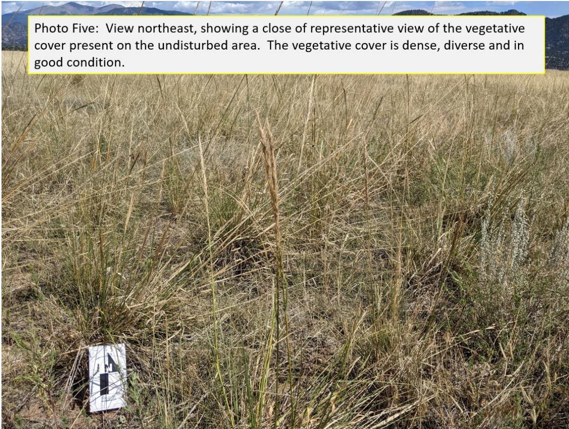
Photo Five: View northeast, showing a close of representative view of the vegetative cover present on the undisturbed area. The vegetative cover is dense, diverse and in good condition.