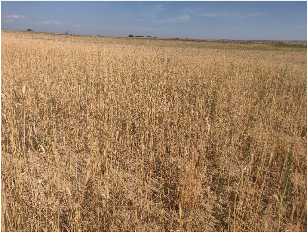
View of the vegetation on the Mining Area "A" side slopes