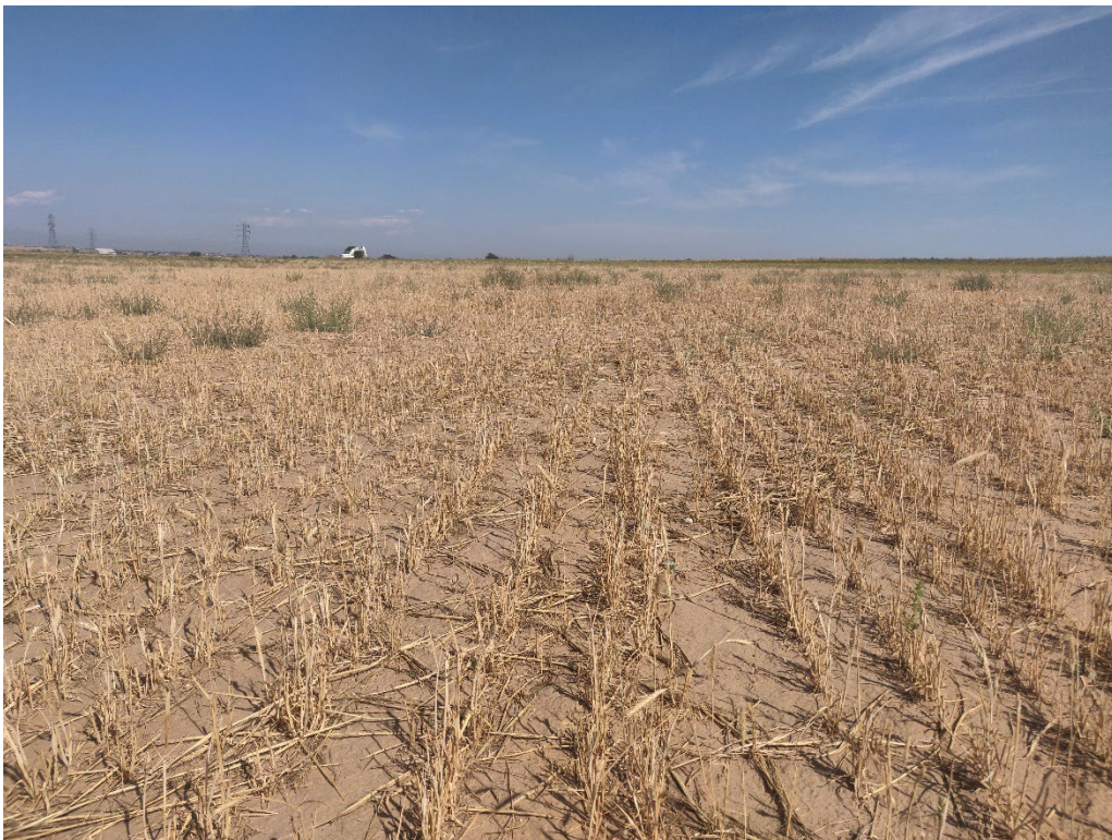
View of the cut grasses in Mining Area "B"