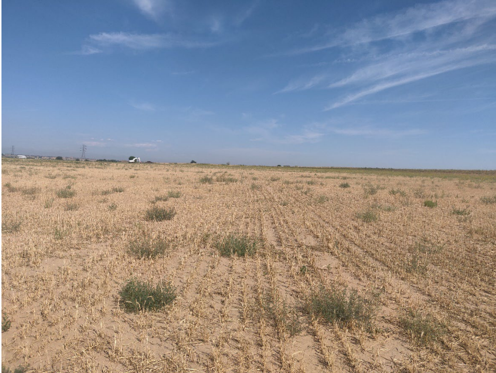
View of Mining Area "B" looking east