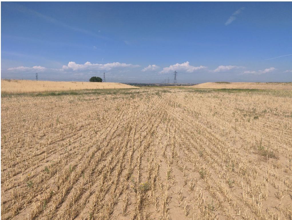
View of Mining Area "A" pit floor looking east