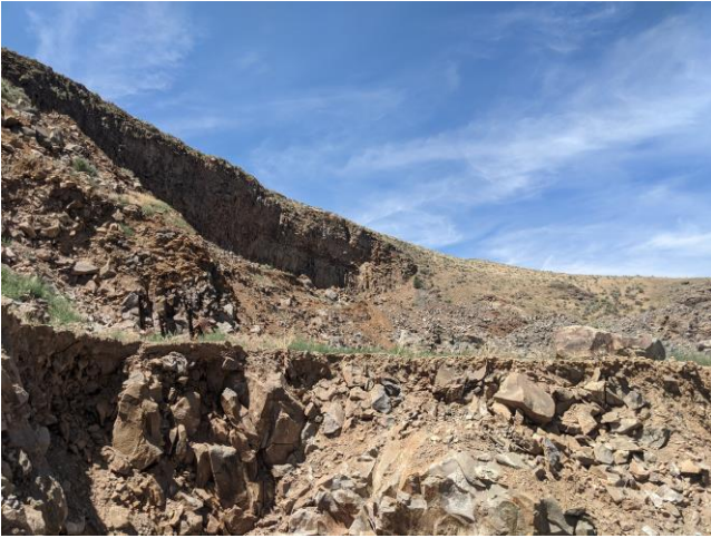
Upper bench from current excavation.

and compared to from GPS to ensure mining was within the approved boundaries. No issues were observed.