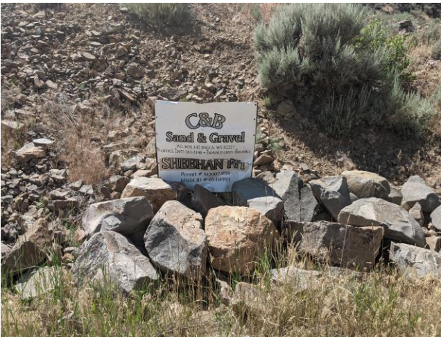
Mine ID sign

The mine identification sign and affected area boundary markers are in place and in compliance with Rule 3.1.12. A sign is posted off of the county road 1 just the south of the site.