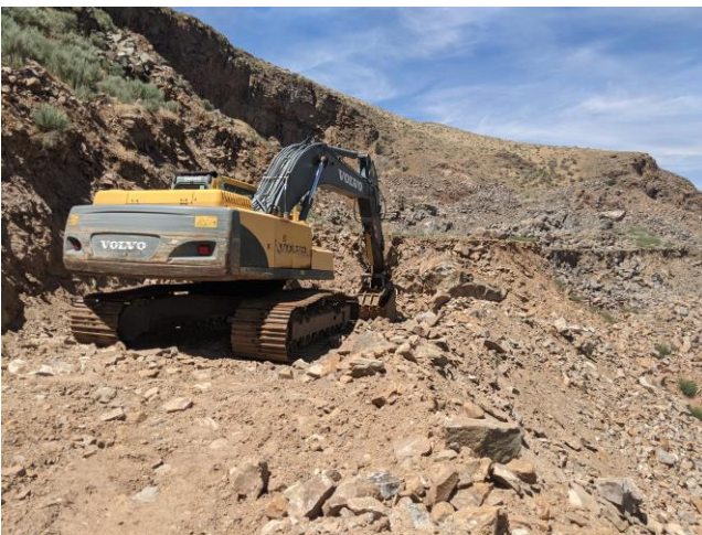
Current excavation area.

No fuel or buildings were on site at the time of the inspection. One excavator and dozer were parked along the access road to the upper section of the site. Access to the upper benches were limited due to the latest excavation and loose material along the steep slope.