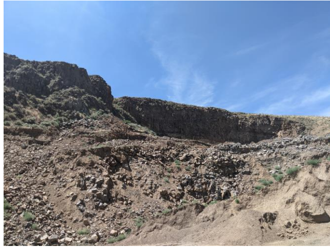
Site from below near county road 1.

Material has been stockpiled adjacent to the county road. Some material has been pulled from the pile but it is unclear to how long ago. Vegetation has begun to establish itself on the stockpile. This area is adjacent to the permit boundary but remains inside.