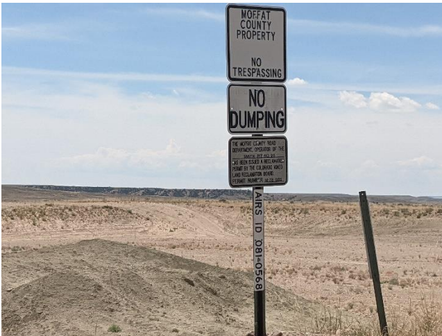
Mine ID sign.

The mine identification sign and affected area boundary markers are in place and in compliance with Rule 3.1.12.