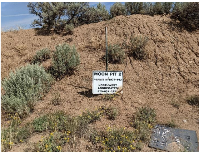
Mine ID sign.

The mine identification sign and affected area boundary markers are in place and in compliance with Rule 3.1.12. High winds appeared to have shifted the sign but was fixed during the inspection to ensure it was visible.