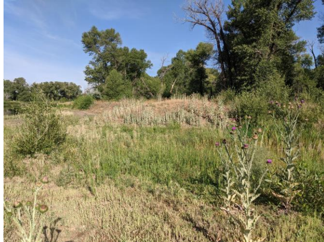
Larger thistle patch.

The Division currently holds a financial warranty amount of $20,545 for this site. Given that the site has been fully reclaimed by the operator, this amount is sufficient to ensure any additional reclamation and/or maintenance of the site could be performed.