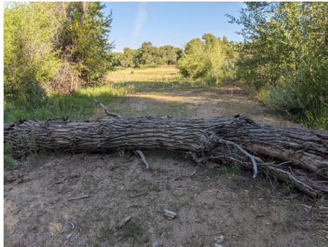
Tree at access road.

The site has been fully reclaimed with no remaining equipment left on site. Excavated areas were below the groundwater table and as such, ponds have been formed. Vegetation along ponds in 'Areas 1', '3' and '4' are very well established and no issues were noted. The portion of the pit named 'Area 2' of the mine showed vegetation however a little more sparse potentially due to saturation from fluctuating seasonal groundwater levels. In some of the lower spots, cat tails have begun to grown in 'Area 2'. While 'Area 2' shows establishment of vegetation, it could benefit from an additional growing season prior to full bond release.