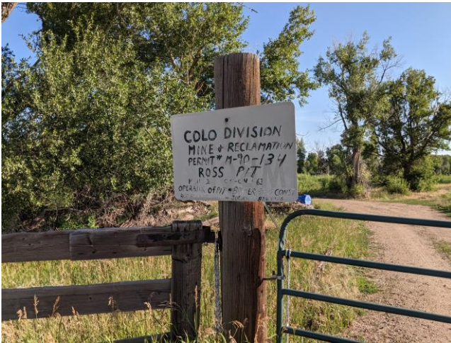
Mine id sign.

The mine sign is located at the entrance of the permit boundary at the gate. Boundary markers were observed in addition to fence lines delineating the boundary. A dead tree has been placed over the access road to ensure trespassers or unwanted machinery from access the reclamation.