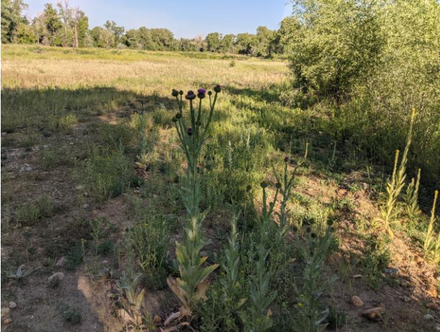
Small thistle patch.