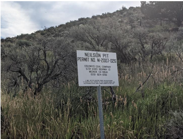
Mine identification sign.

The mine identification sign and affected area boundary markers are in place and in compliance with Rule 3.1.12.