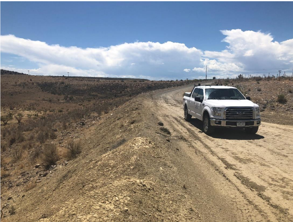
East side of site