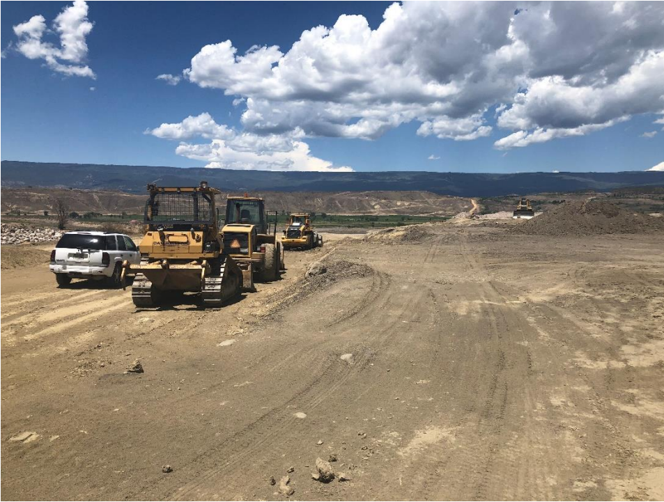
Equipment and material storage