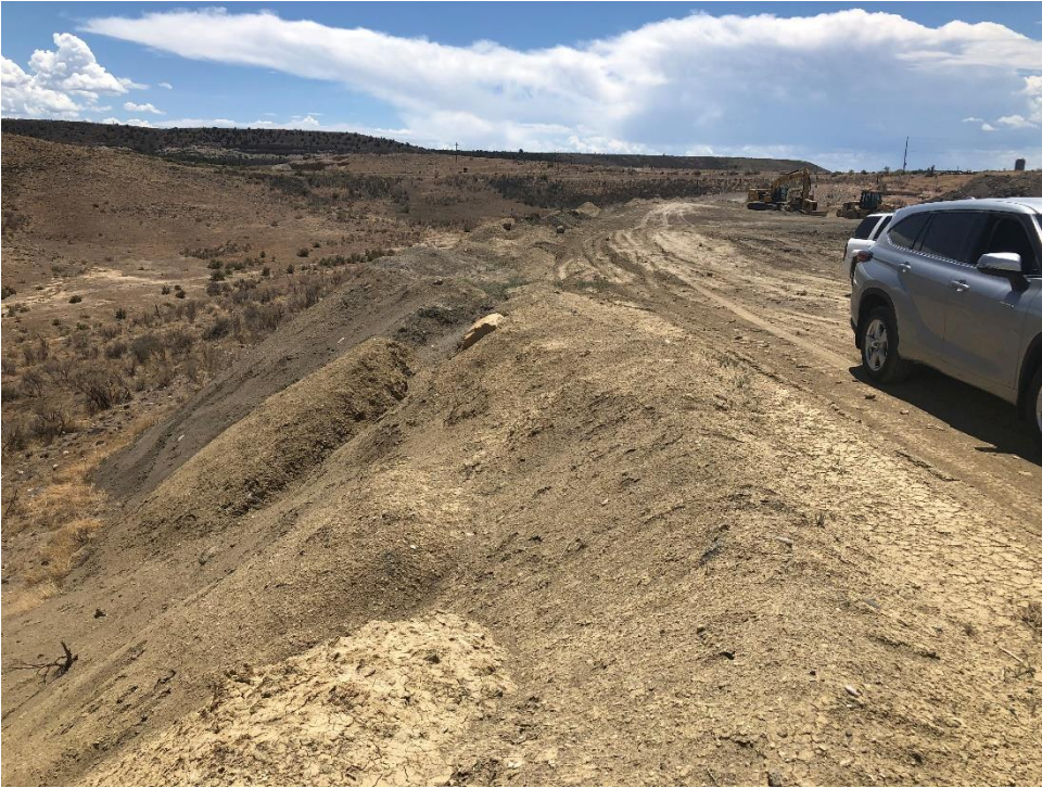
Berm in need of repair