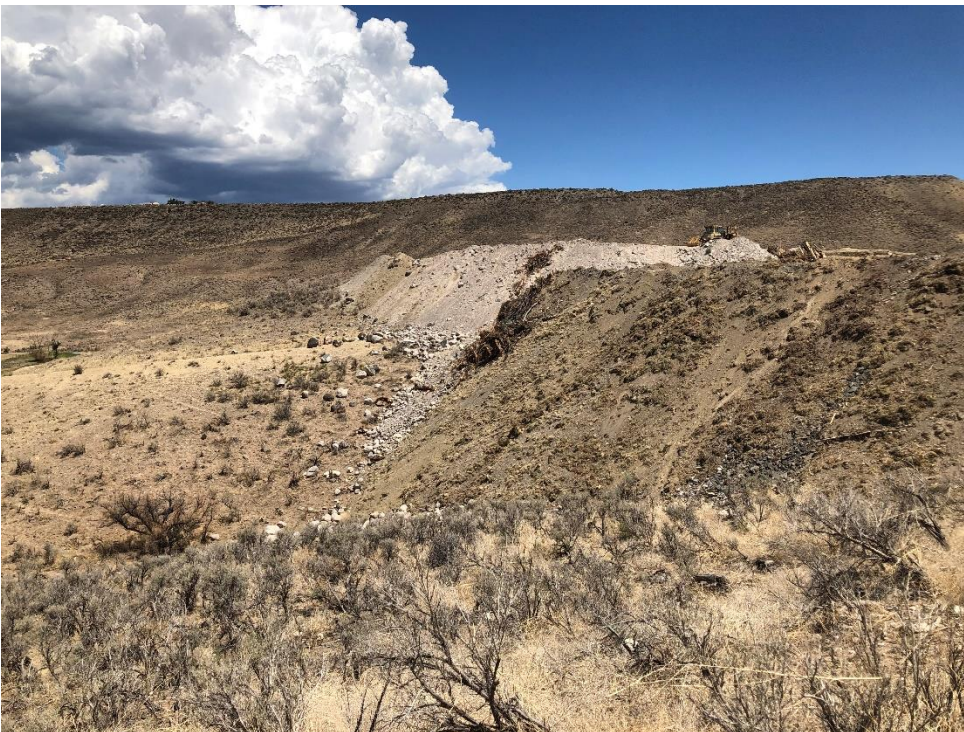
Slope at northeast corner where a revised reclamation plan is needed