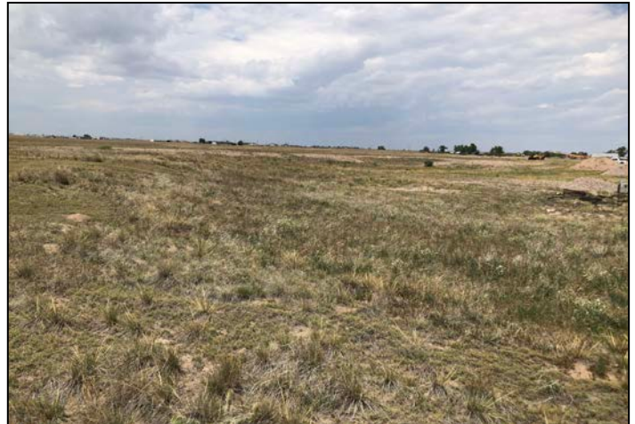
Photo 2 - Photos 2-5 are representative site conditions at the time of the release inspection.