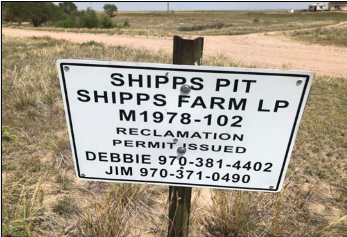
Photo 1 - Site identification sign near south entrance to permit area.