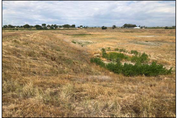
Photo 2 – Southeast corner of Vincent West lined cell looking West.