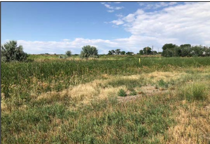
Photo 3 – Unmined “wetland” near southwest corner of Vincent West cell looking SW.