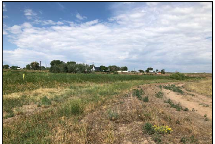
Photo 4 – Unmined “wetland” near southwest corner of Vincent West cell looking West.