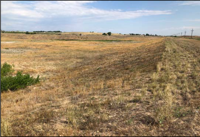
Photo 1 – Southeast corner of Vincent West lined cell looking North.