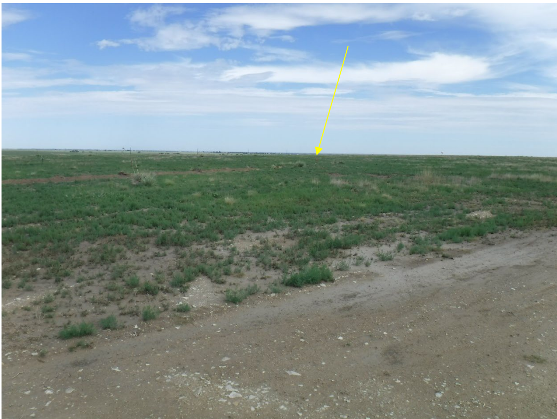
Photo 4: Permit boundary marker (arrow) west side of permit area, looking north