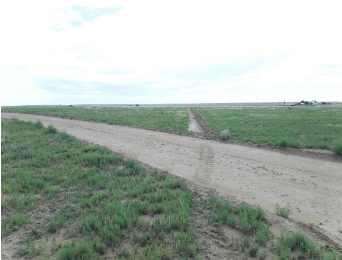
Photo 3: Grubbed in visual marker for permit boundary, south end of permit