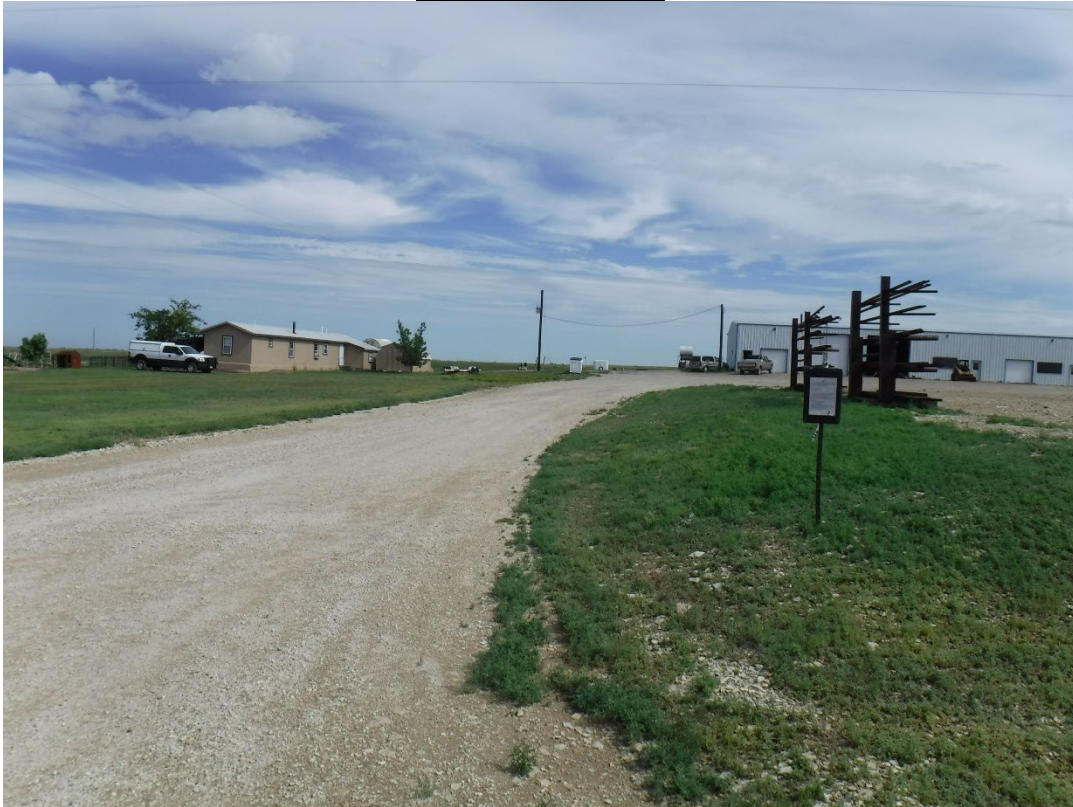
Photo 1: Entrance to Stoddard Construction, note notice sign right of center