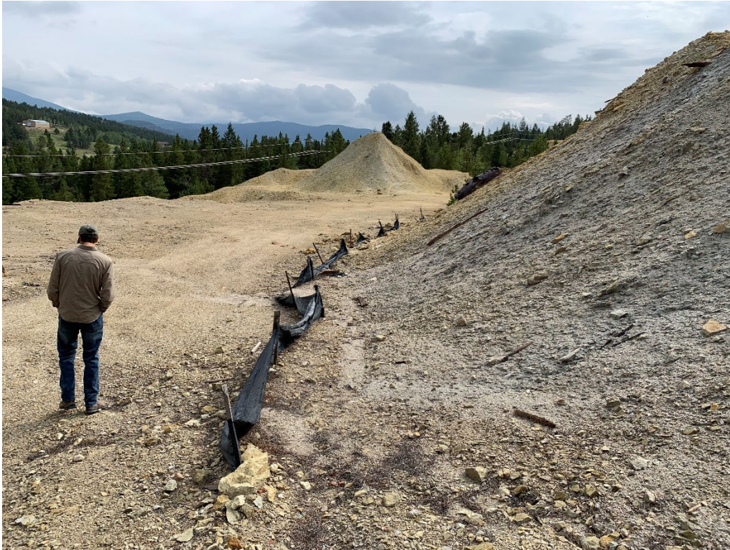
Photo 3 – North permit boundary of Williams claim looking east with erosion control silt fences