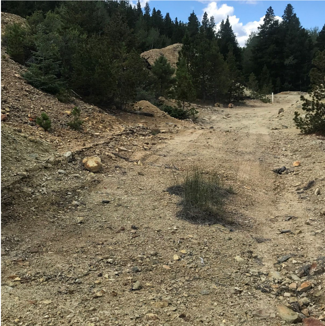
Photo 5 – North permit boundary facing west, erosion control structures removed

Nevadaville Encore, LLC 17115 Carlson Dr., #1613 Parker, CO 80134