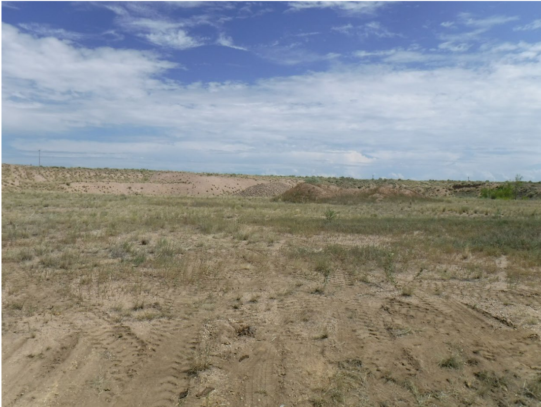
Photo 5: Looking east at the eastern pit wall, note stockpiles of material