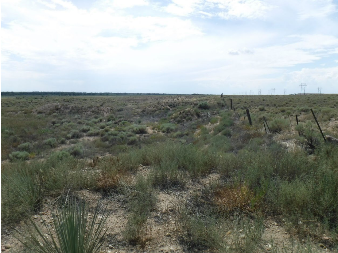
Photo 3: Looking west along the northern permit boundary, fence line marks boundary