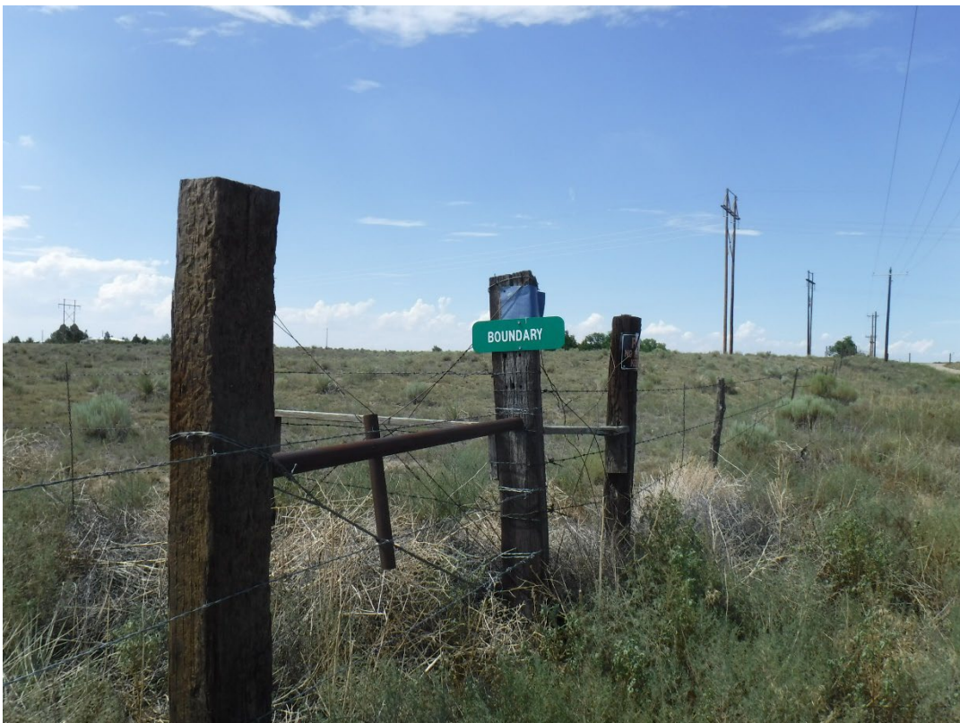
Photo 2: Typical permit boundary marker, NE corner marker pictured