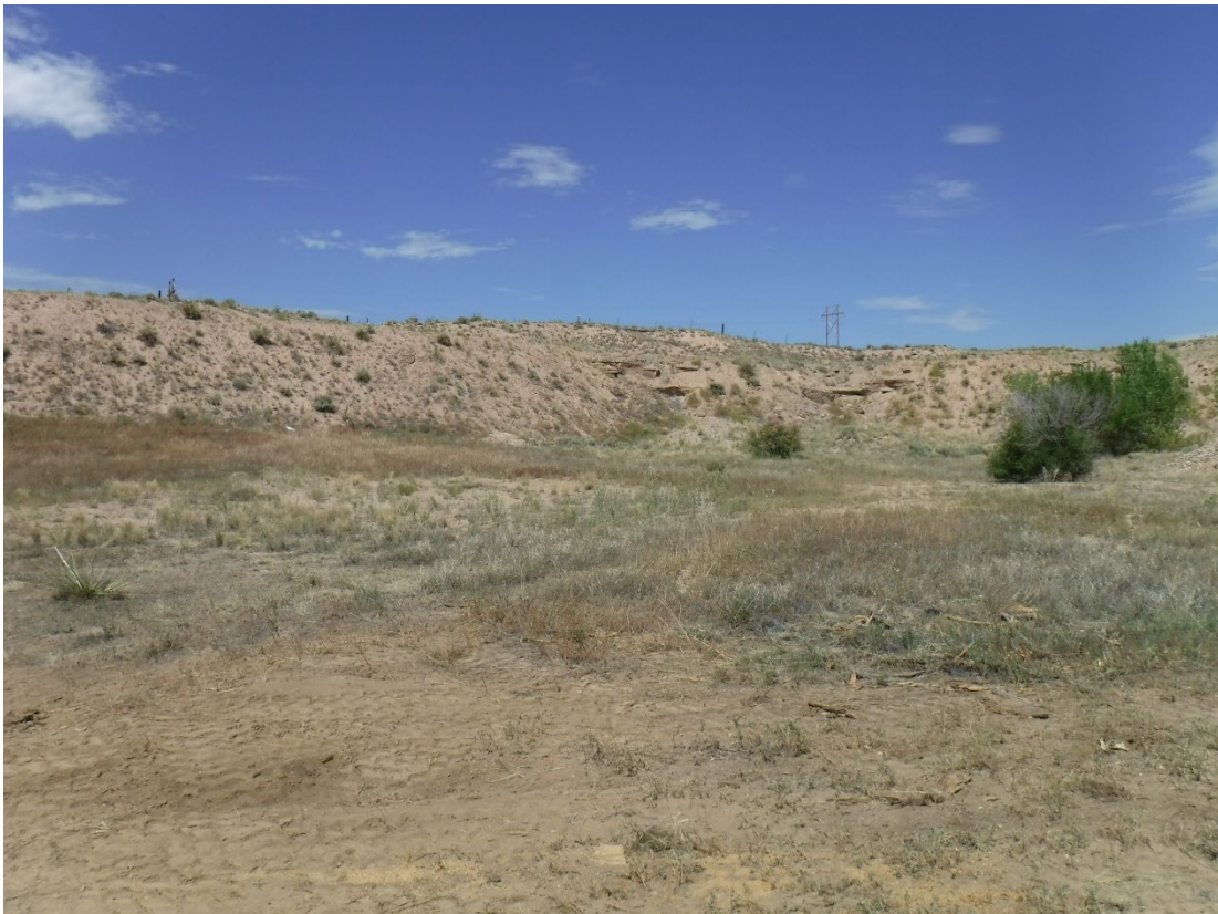
Photo 4: Looking at the northwest corner of pit area that has highwalls that need to be graded to 3H:1V slope