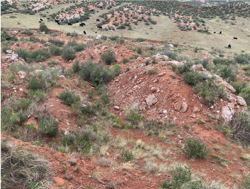
Photo – Topsoil/overburden stockpiles east of pit area

Theisen Mineral 22585 S. Holland Way Lakewood, CO 80227