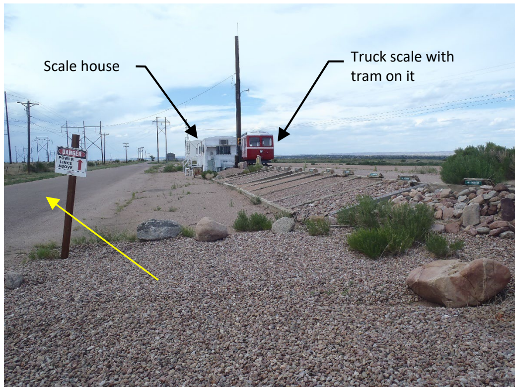
Photo 6. Paved access road on west side of permit area (north of City Building, looking north).