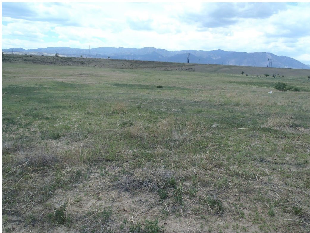
Photo 8. Typical revegetation (east parcel, looking SW towards transmission line).