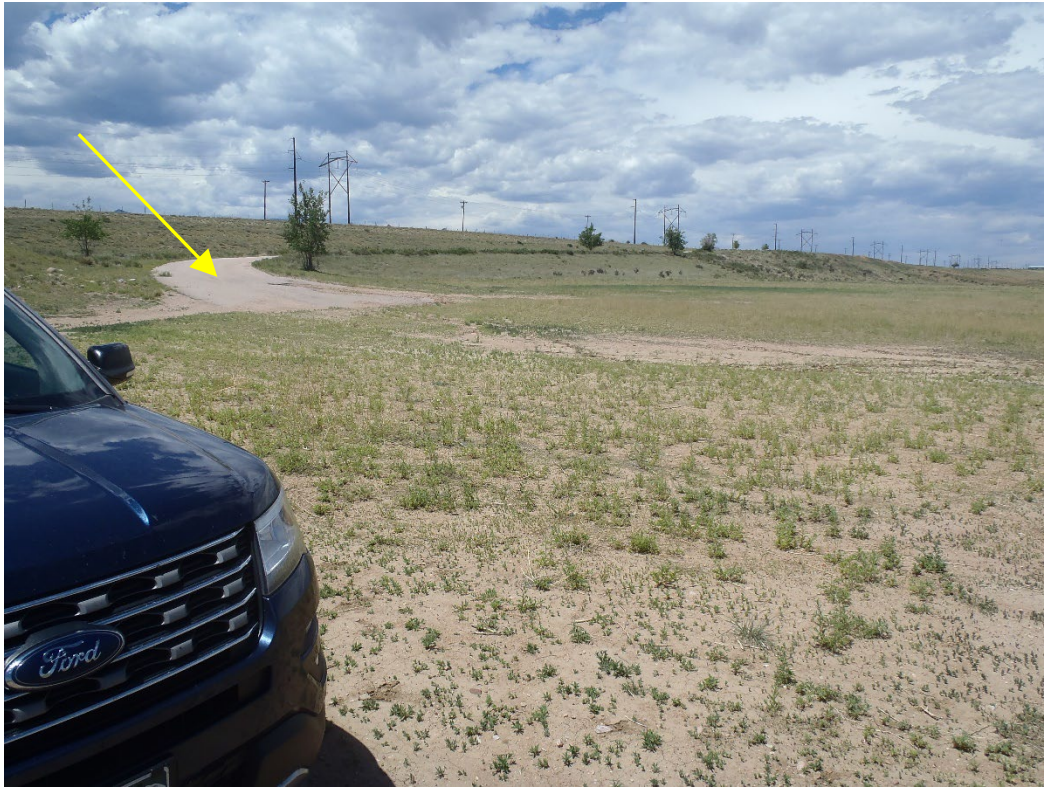
Photo 5. Paved access road to south end of west parcel & pit floor reveg (looking NW).