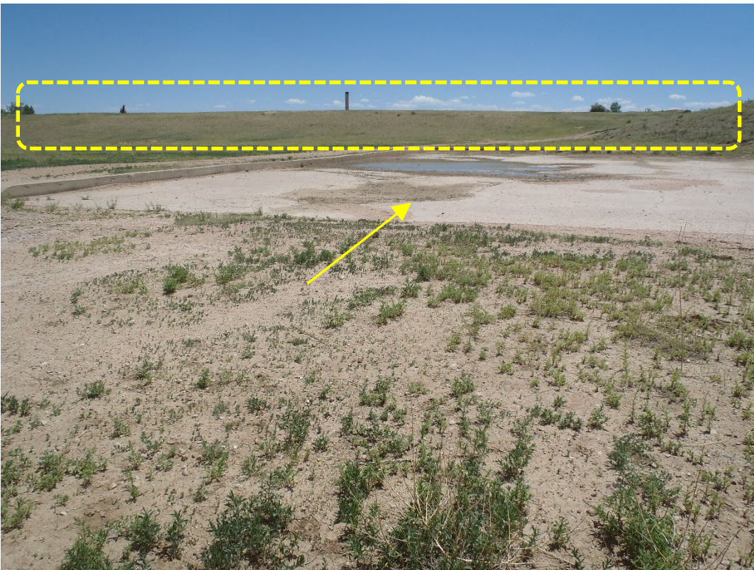
Photo 2. Sloped highwall on south end of west parcel (looking south, concrete pad in foreground).