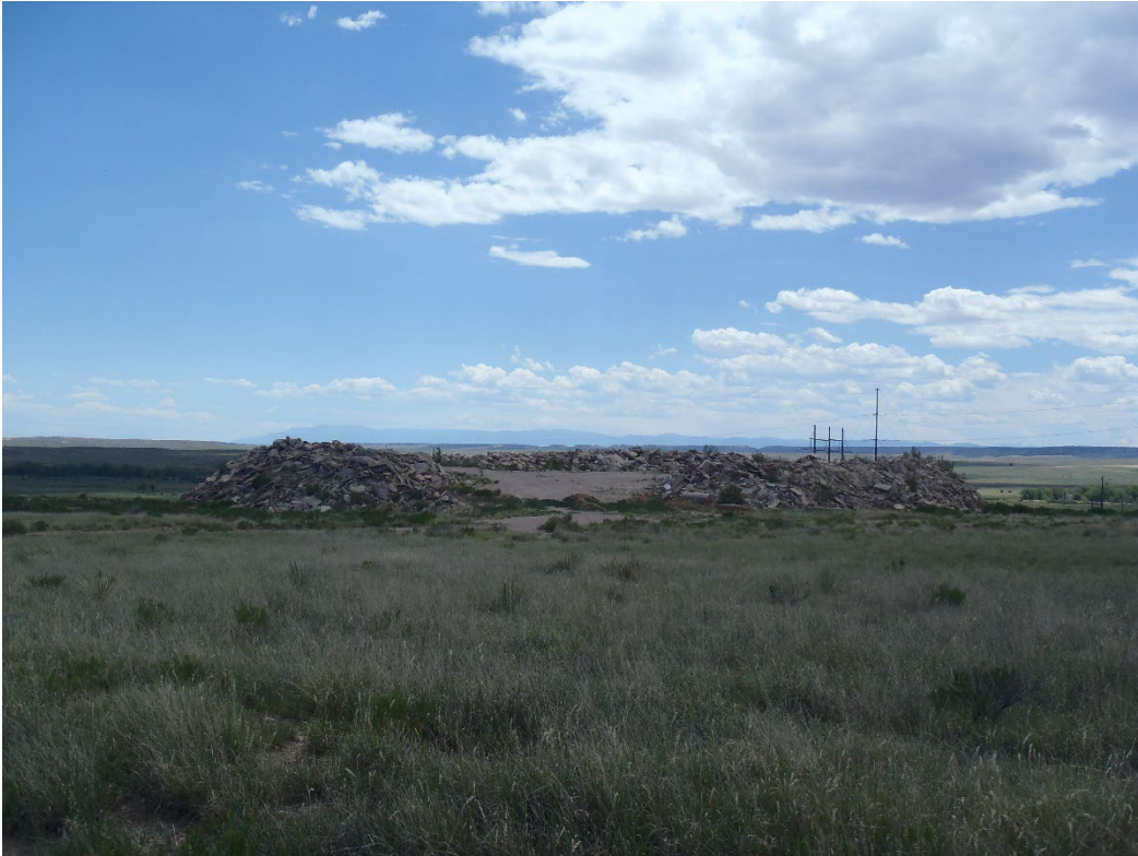
Photo 7. Concrete rubble stockpile in SW corner of permit area (Looking SW).