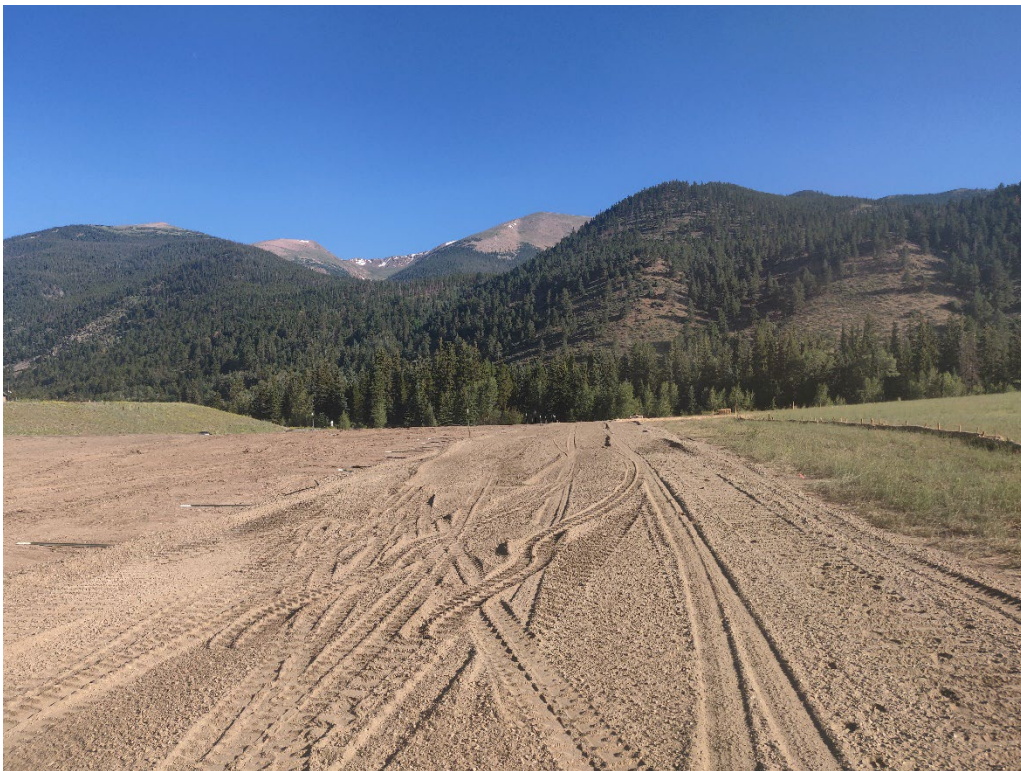
View of the access road from the south end looking north