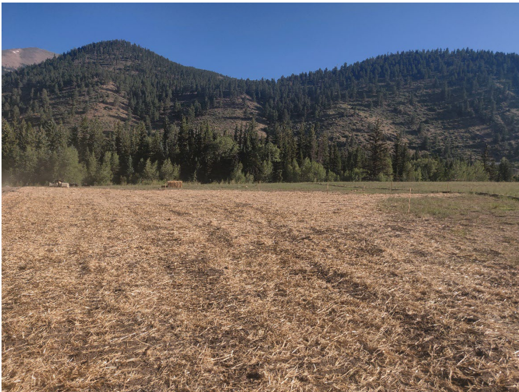
View of the project area from the south side looking north