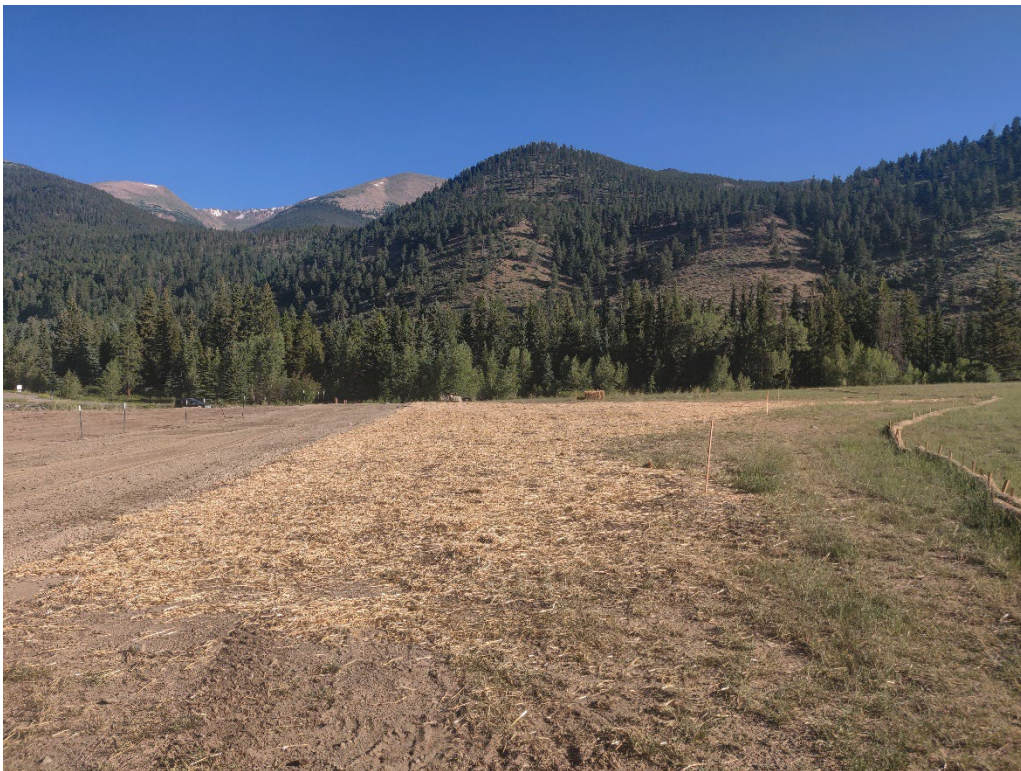
View of the project area and access road from the south side looking north