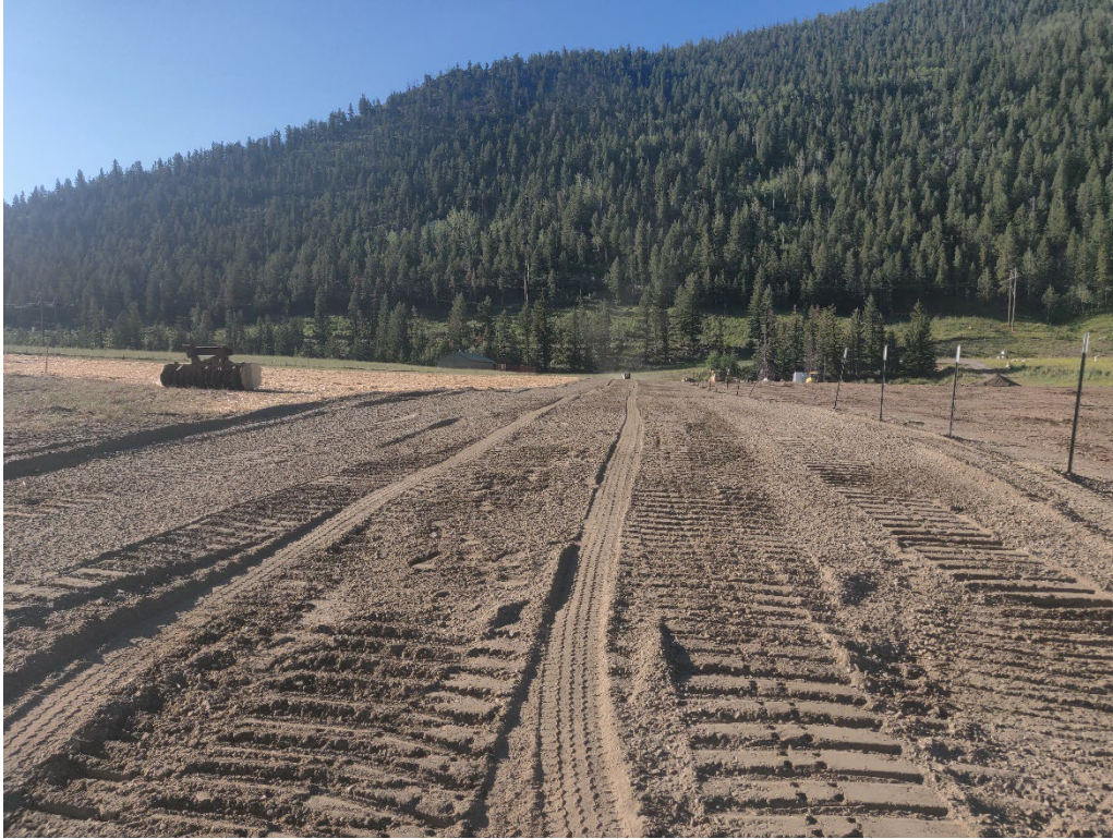
View of the access road from the north end looking south