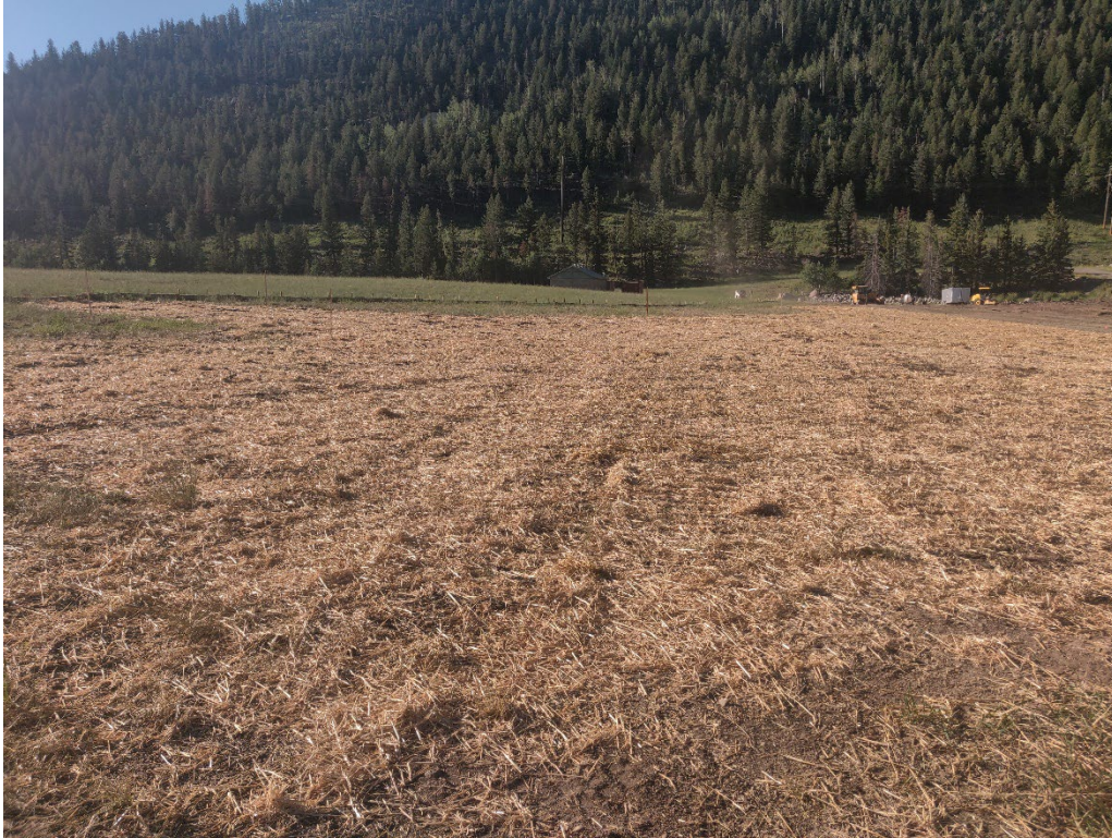
View of the project area from the north side looking south