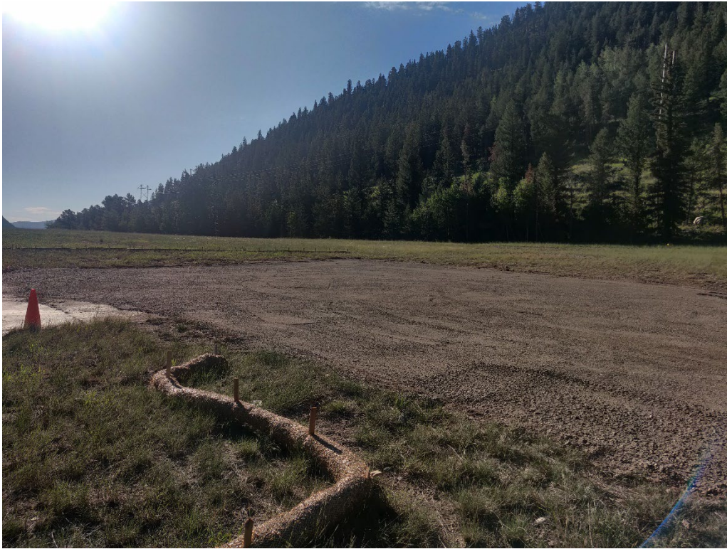
View of the turnaround area