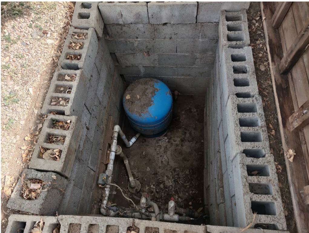
View of the inside of the Shimon well vault