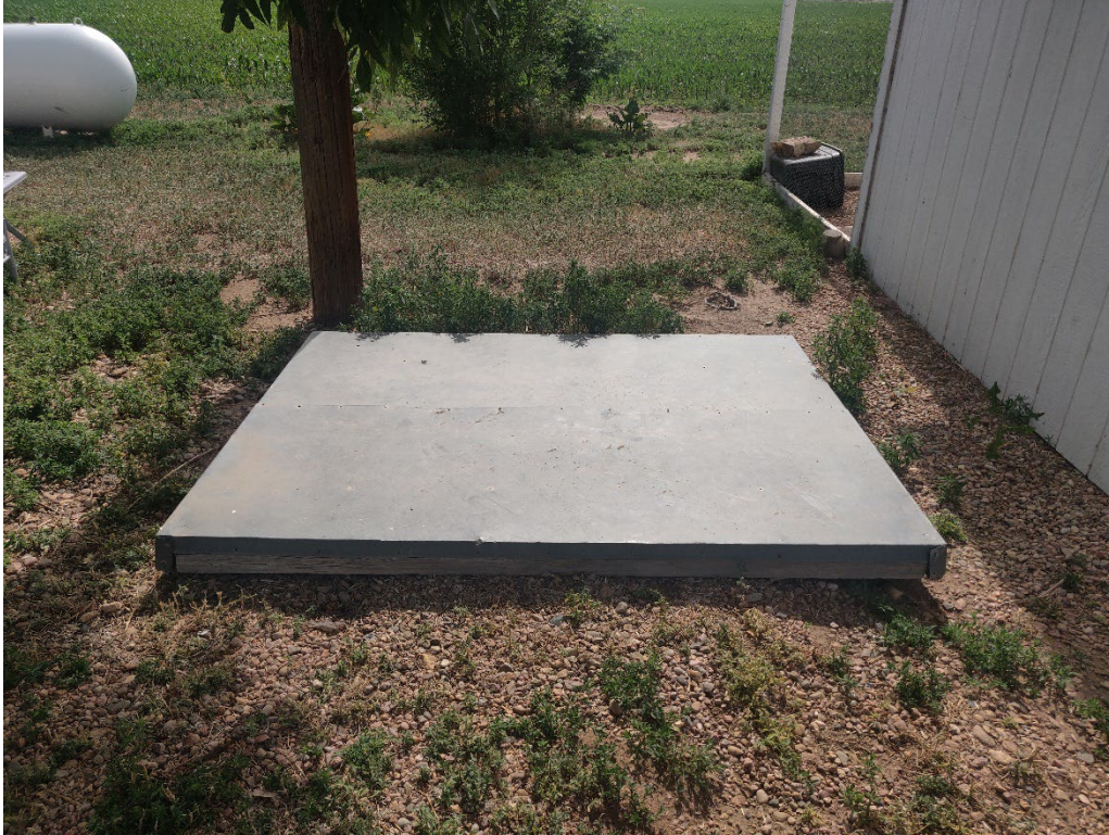
View of the outside of the Shimon well vault