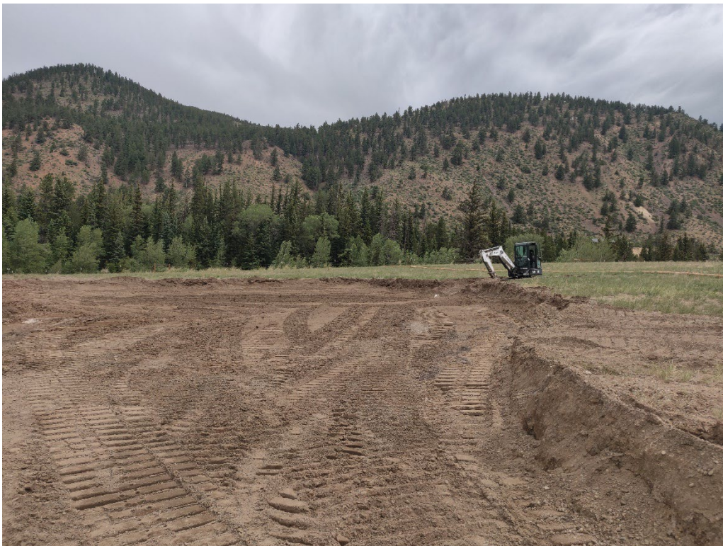
View of the excavation in the project area