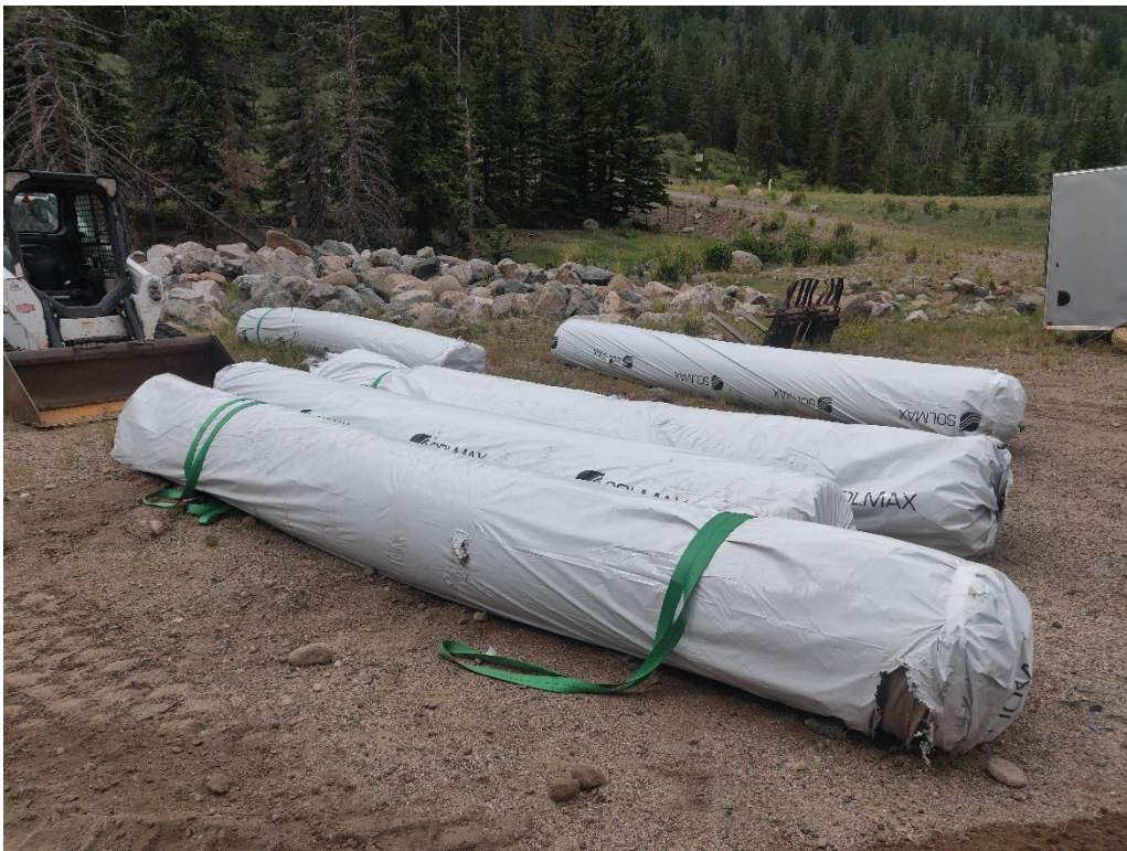
View of geosynthetic clay liner rolls