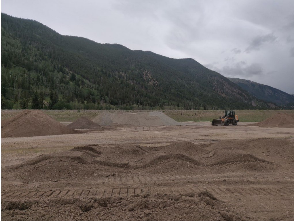
View of stockpiles of topsoil, overburden and road base