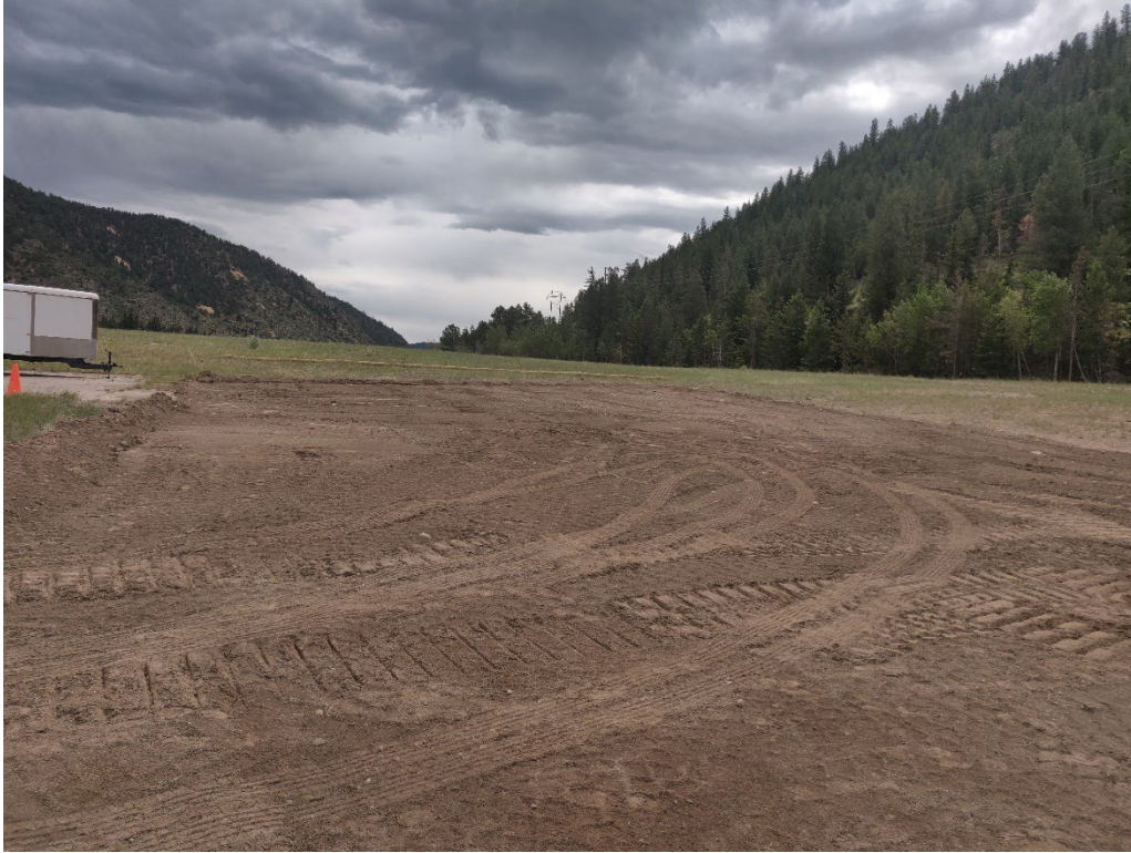
View of the turnaround area