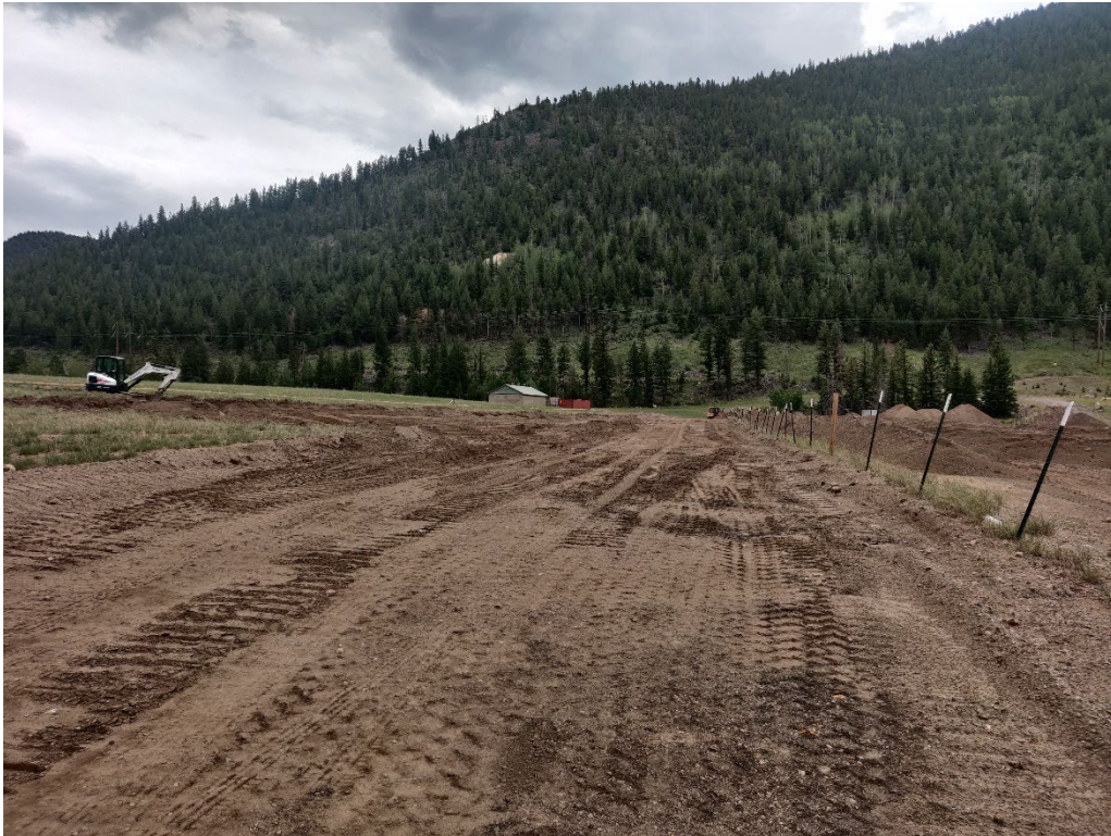
View of the road construction from the north end looking south