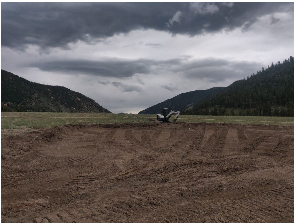
View of the excavation in the project area