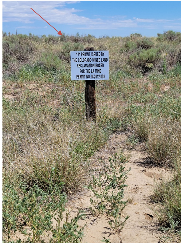
Mine entrance sign/boundary maker in southwestern corner of permit area. Arrow points to topsoil berm bordering pit.