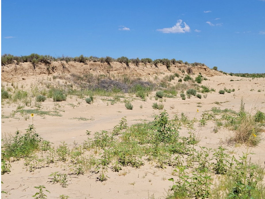
Looking west at mine wall.