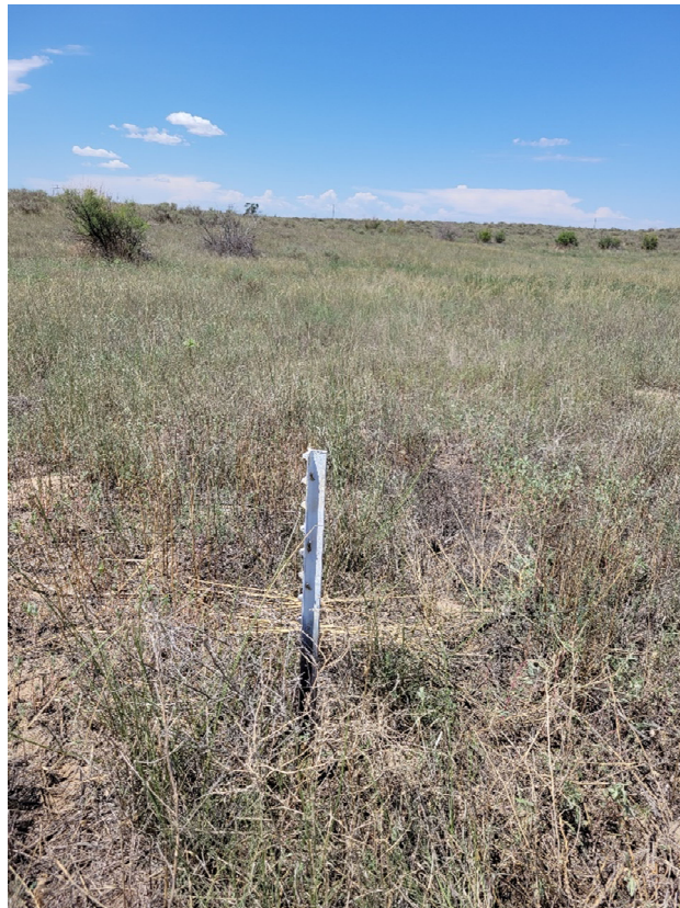
Looking southwest, northeast corner boundary marker. Native vegetation within permit area.