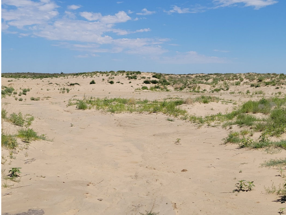
Looking northwest from access road into pit area.