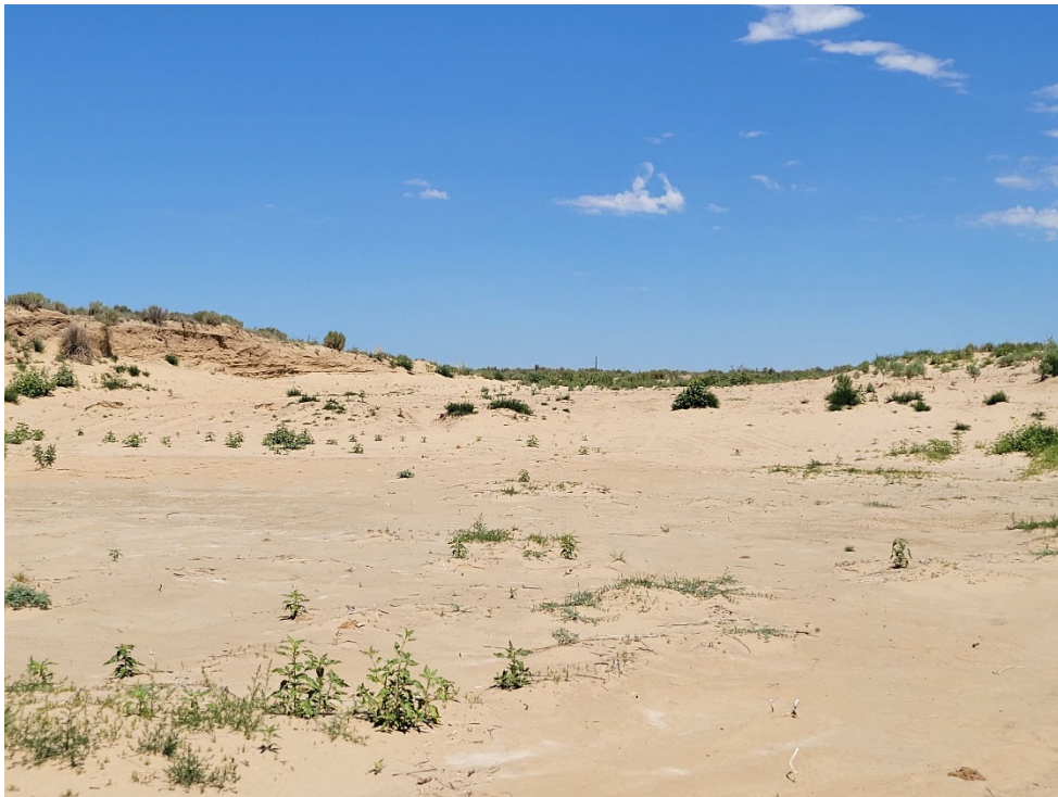
Looking northwest at mine wall.