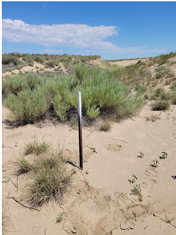
Boundary marker along access road at entrance to pit area.