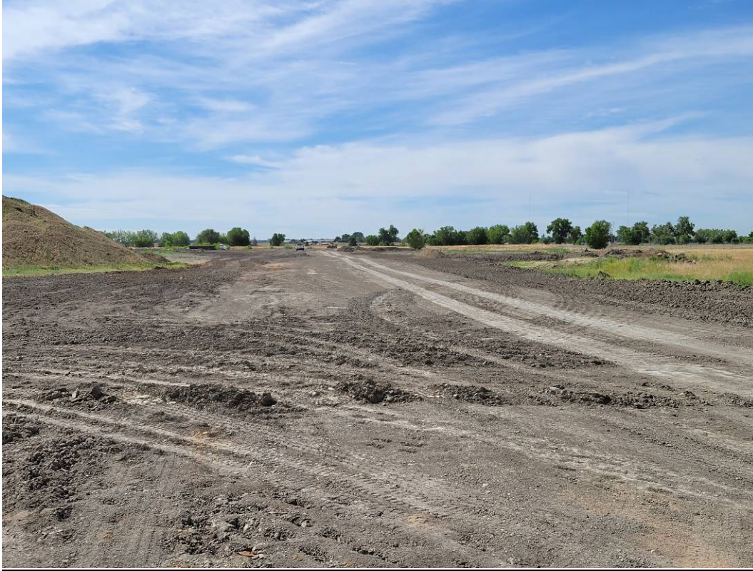
Looking south across North Pond parcel; area of active grading.