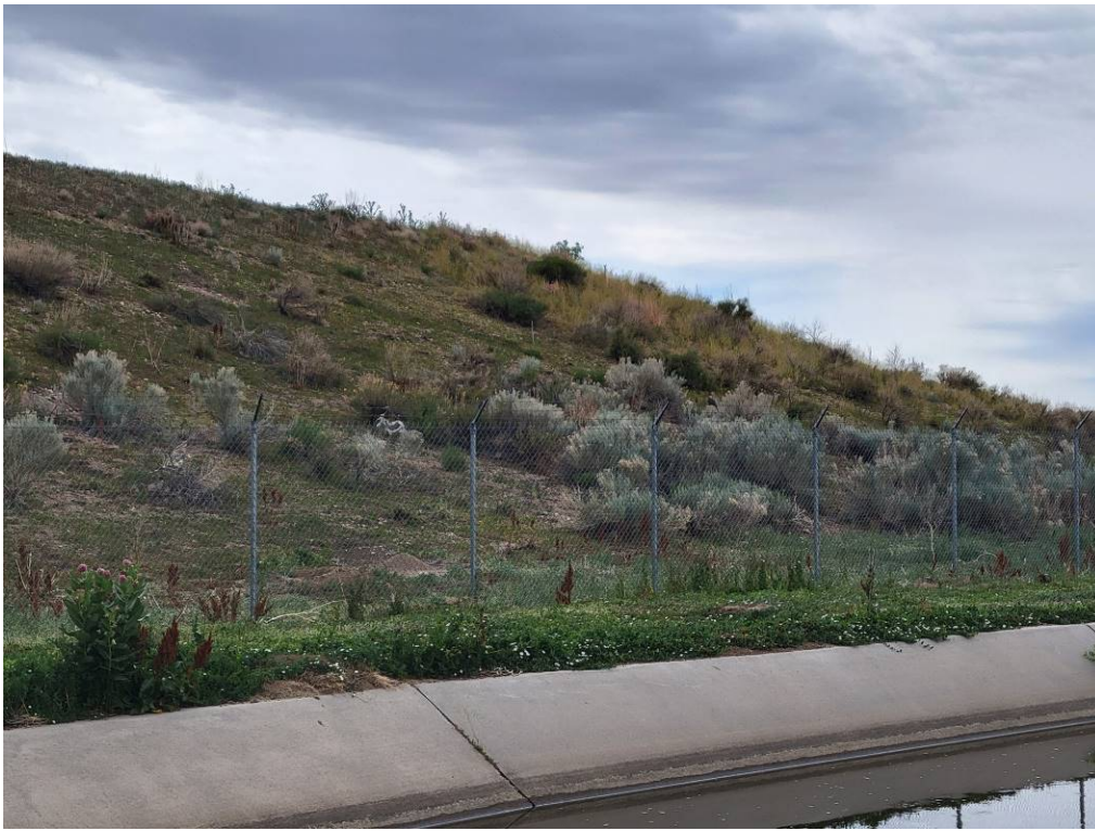
Thistle and cheatgrass noted on top of stockpile in southwest corner of the South Pond reservoir.