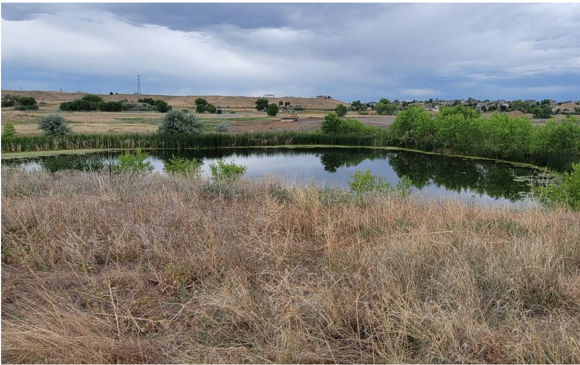
Wetland outside southern boundary of permit area.