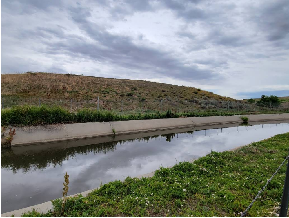
Stockpile in southwest corner of the South Pond reservoir.