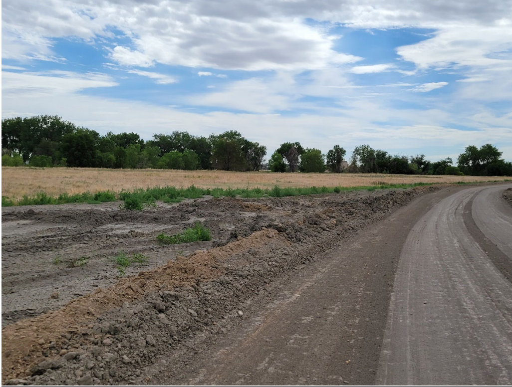
Looking east toward South Platte River reclaimed area along access road. Native grasses surround area of active reclamation.