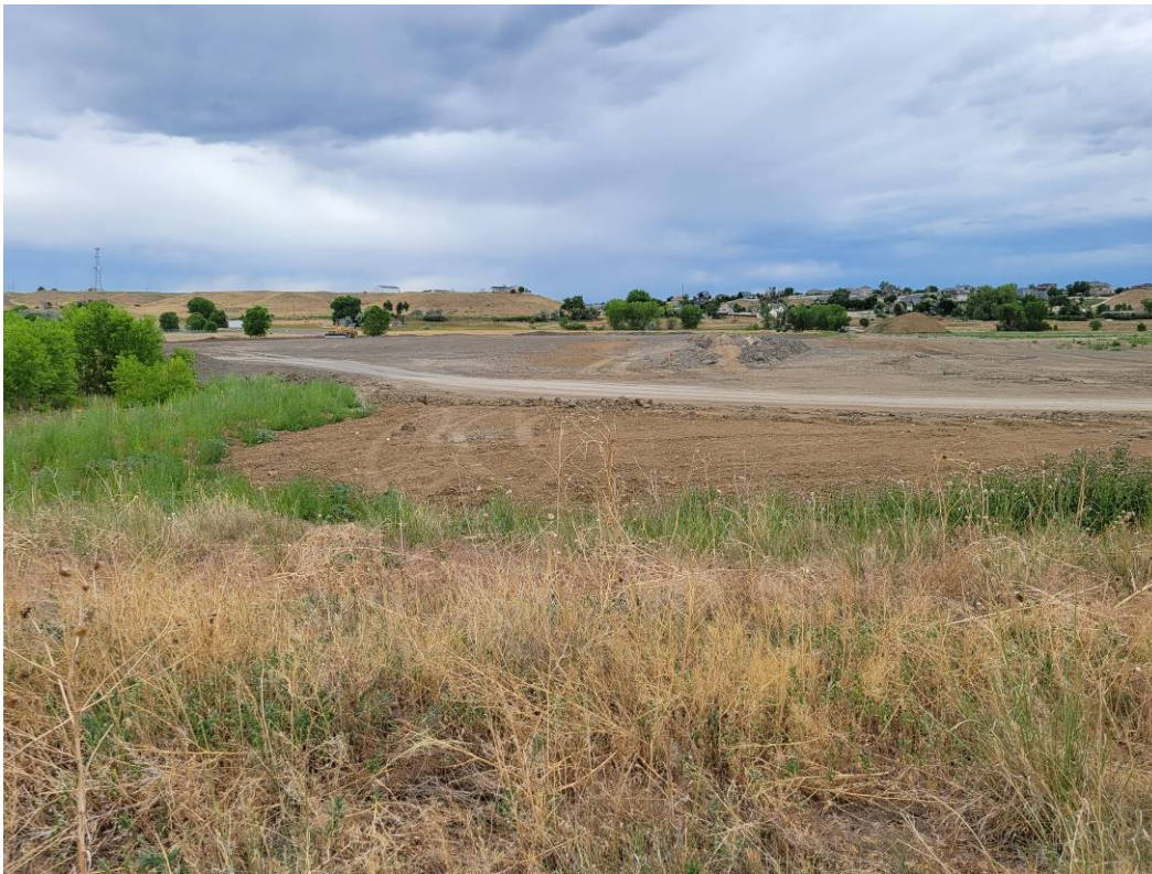
Looking northwest from southeastern corner of permit area.