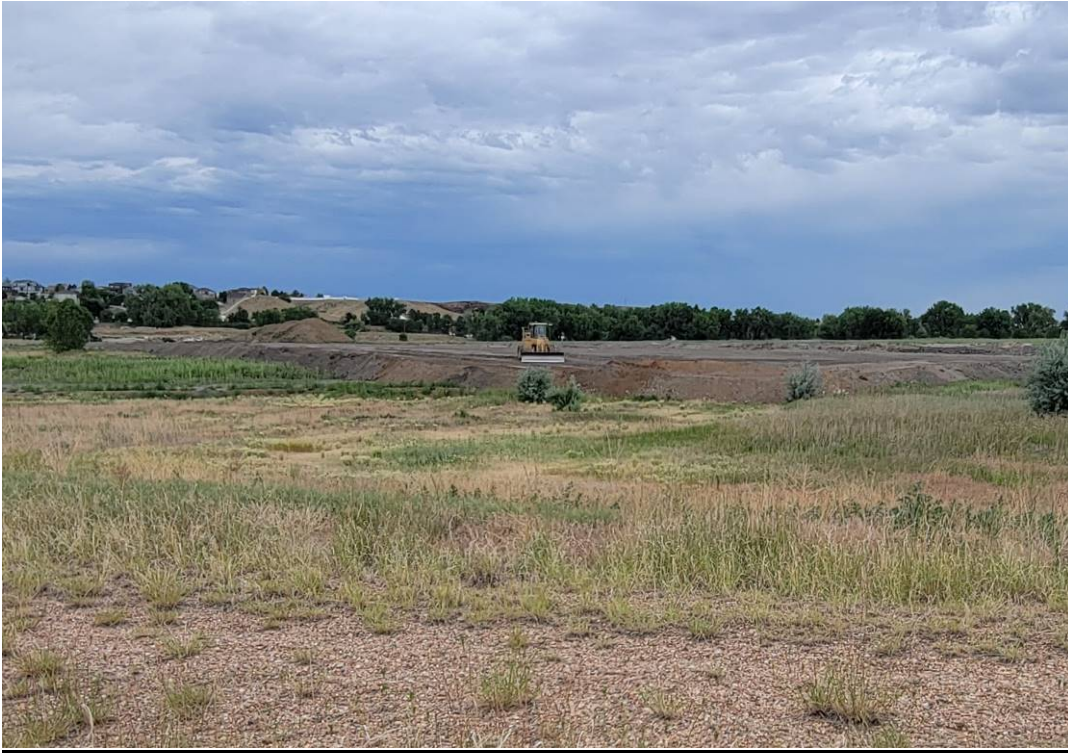
Looking north from southern boundary of permit area. Bulldozer grading North Pond area.