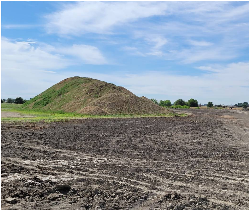
Looking south at topsoil pile in center of active grading area.