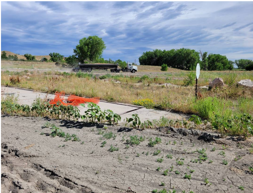
Truck entering North Pond parcel; annual weeds noted and remnants of old truck scale.