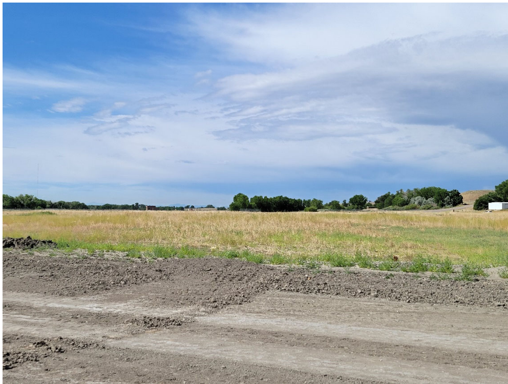
Upland area west of active reclamation area.