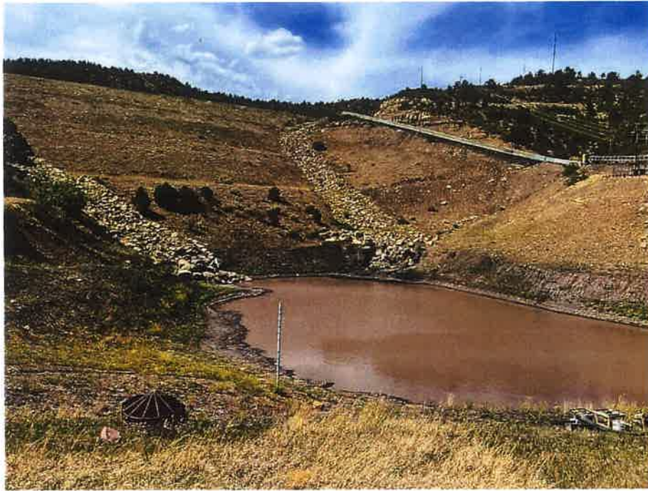
Face of Refuse Disposal Area