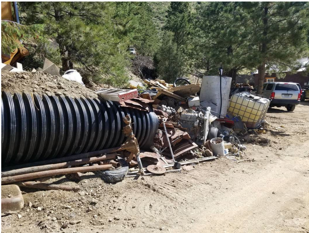
Figure 7. Trash, debris and equipment stored west of the shop.