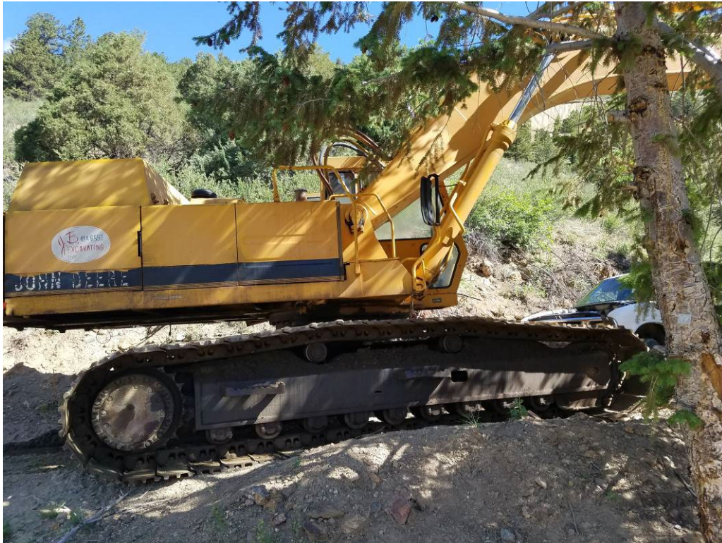
Figure 8. Excavator parked west of shop.