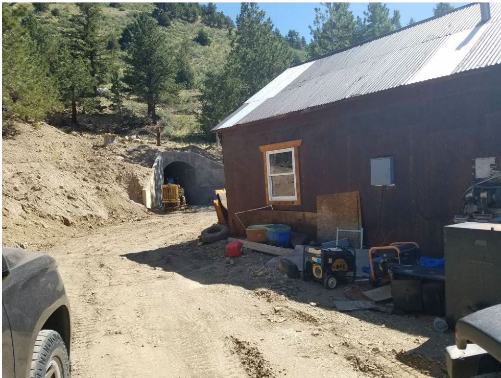
Figure 3. Shop/Garage