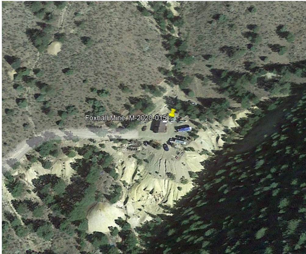
Figure 1. Google Earth Aerial Image dated 9/13/2019

the Fox Hall Tunnel may be considered a mining operation in accordance with C.R.S. 34-32-103(8). In accordance with C.R.S. 34-32-109(2) any operator proposing to engage in a new mining operation must first obtain from the board or office a reclamation permit. Failure to obtain a permit may result in a cease and desist order being issued and carries a civil penalty of $1000 to $5000 dollars a day.