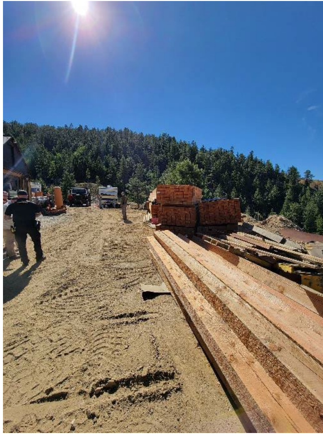
Figure 4. Lumber stored on site.