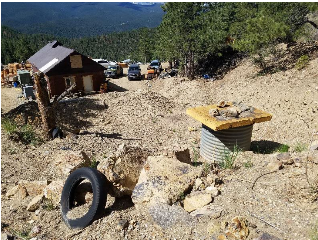
Figure 5. View from above the portal looking south/south west.