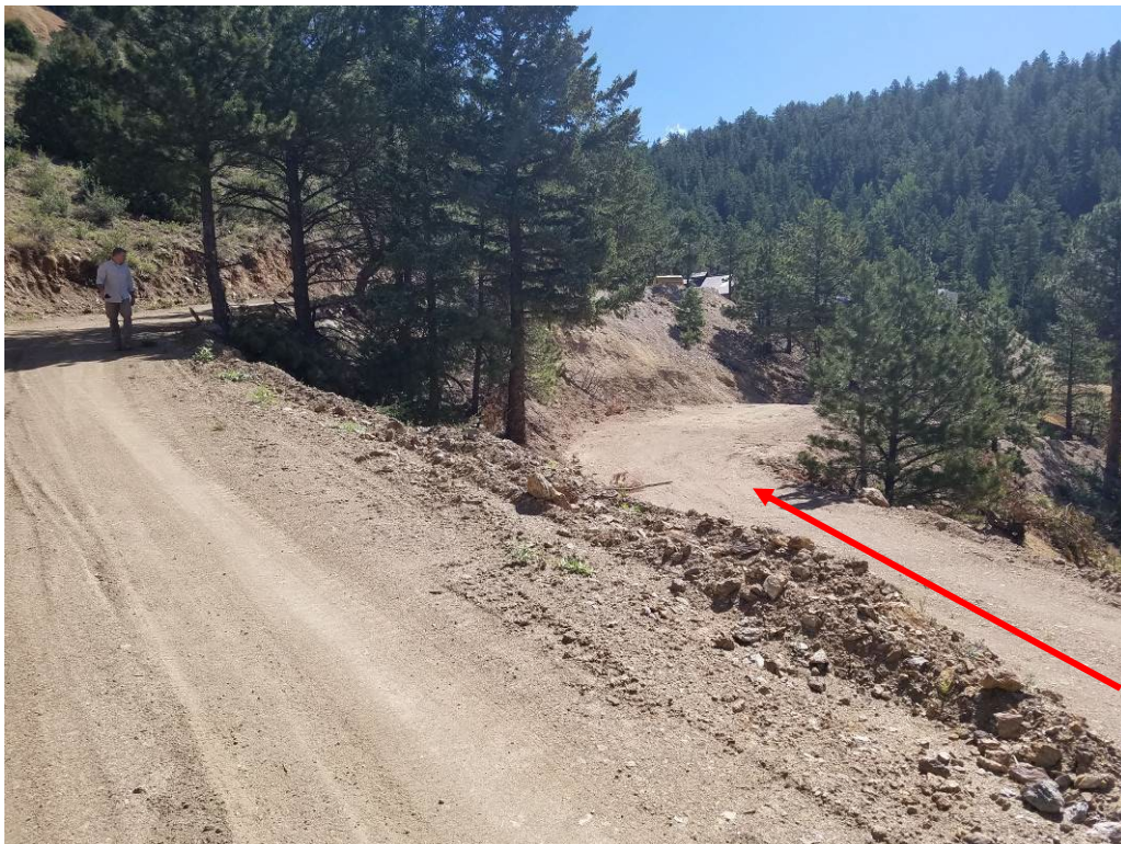
Figure 9. Road branching off the main road to the recent excavation into tailings/waste rock.