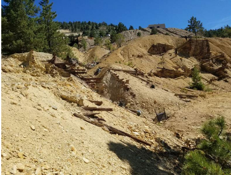
Figure 6. Tailings and waste rock below the Fox Hall Mine portal, view from south looking north.