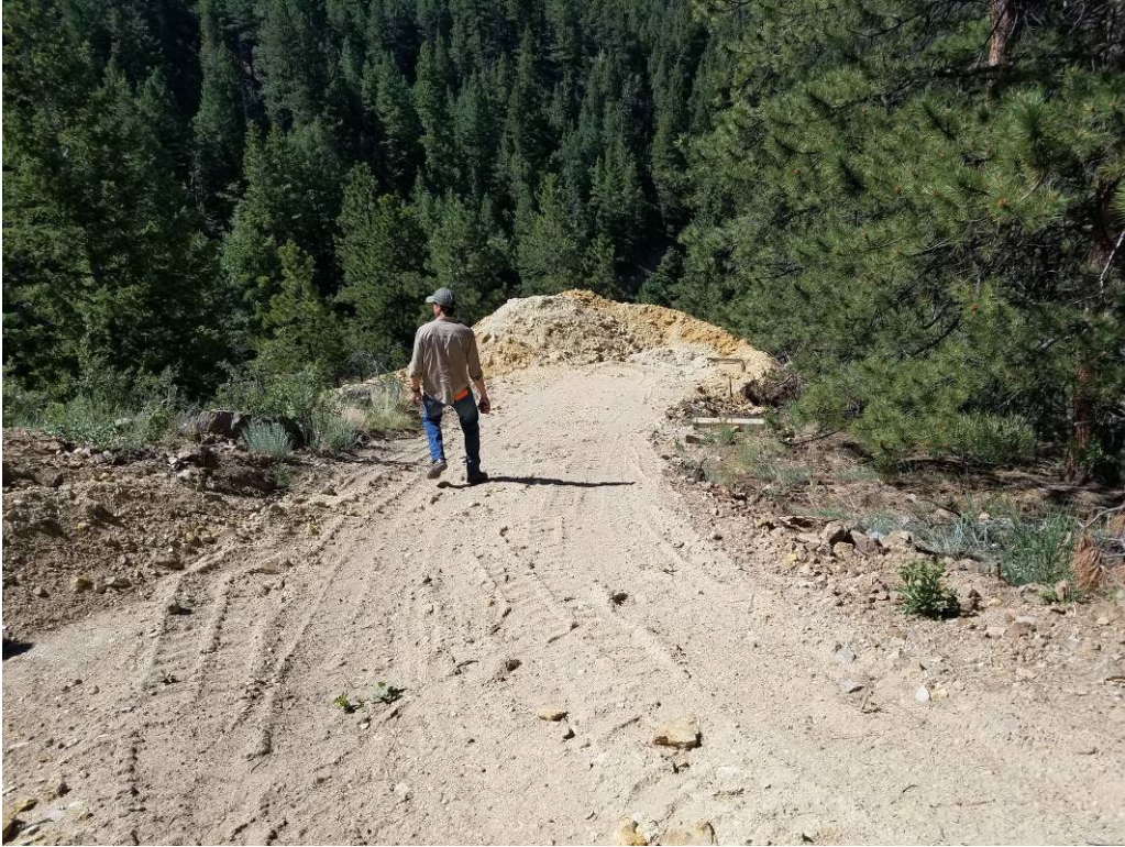
Figure 10. Road constructed to top of tailings/waste rock pile recently excavated.