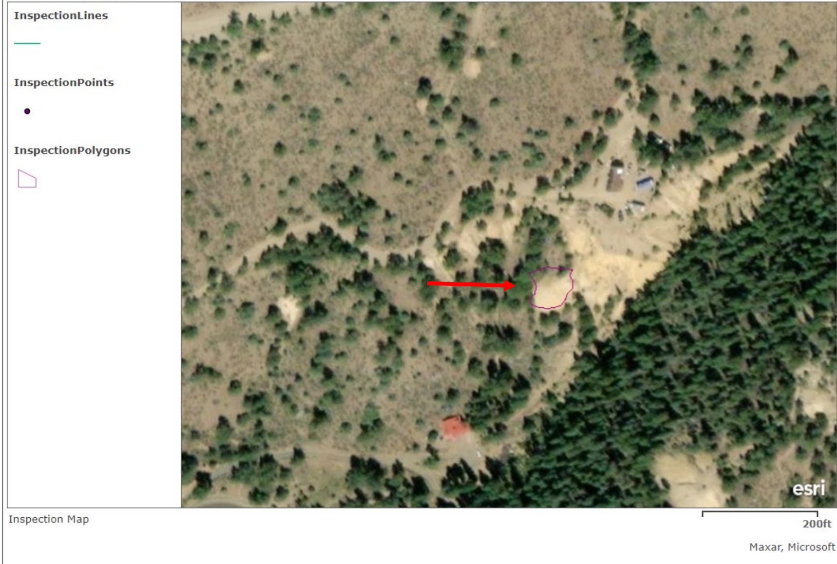
Figure 12. Location of pile where recent excavation has occurred.