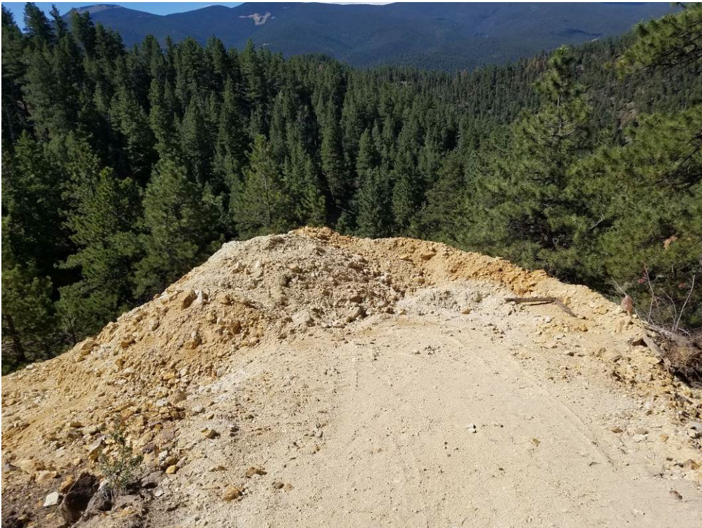
Figure 11. Top of recently excavated pile.