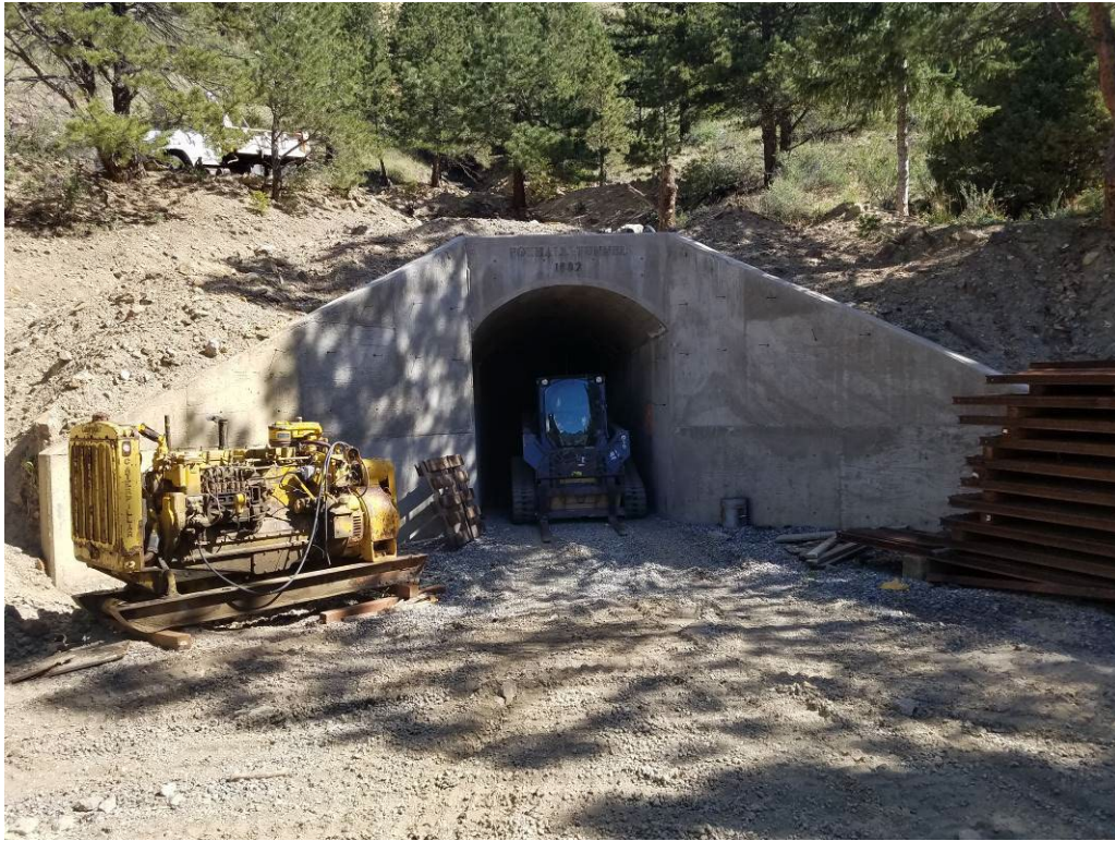
Figure 2. Fox Hall Portal.