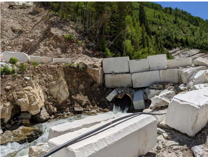
Yule Creek Diversion Area