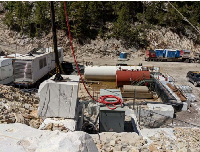
Gensets and Fuel Storage in Franklin area