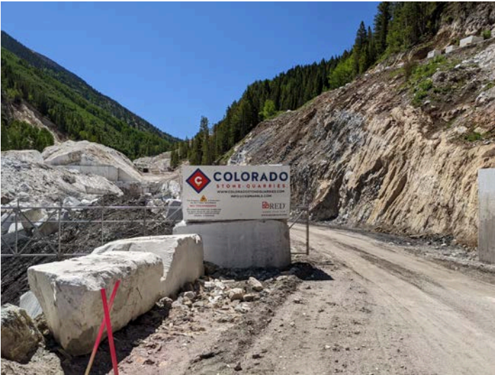
Site Entrance Secured by Locked Gate