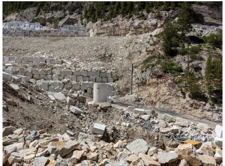
Waste rock placed above Franklin Quarry