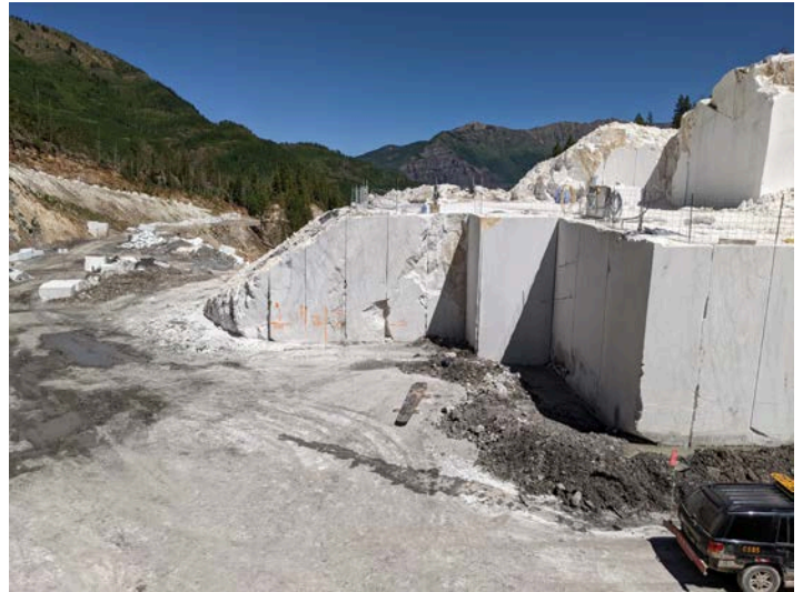
Franklin Quarry Area