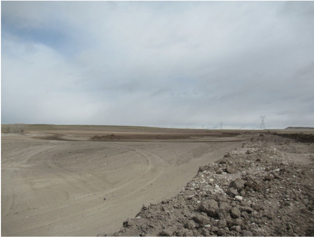
View of Phase 2 from the southwest highwall looking northeast