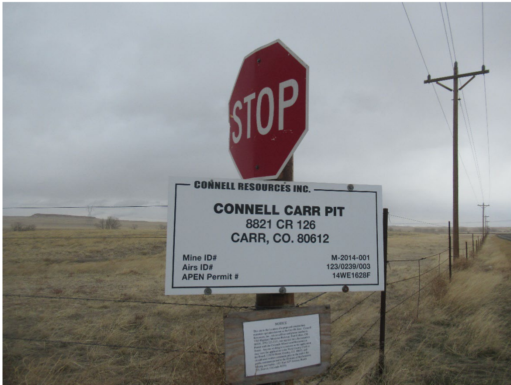
Connell Car Pit mine sign