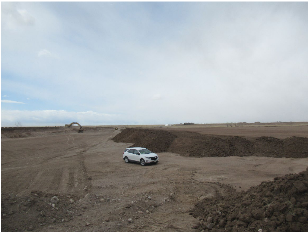
View of Phase 2 from the northeast highwall looking west