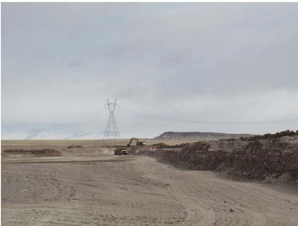
View of the mining excavation in the northeast corner of Phase 2