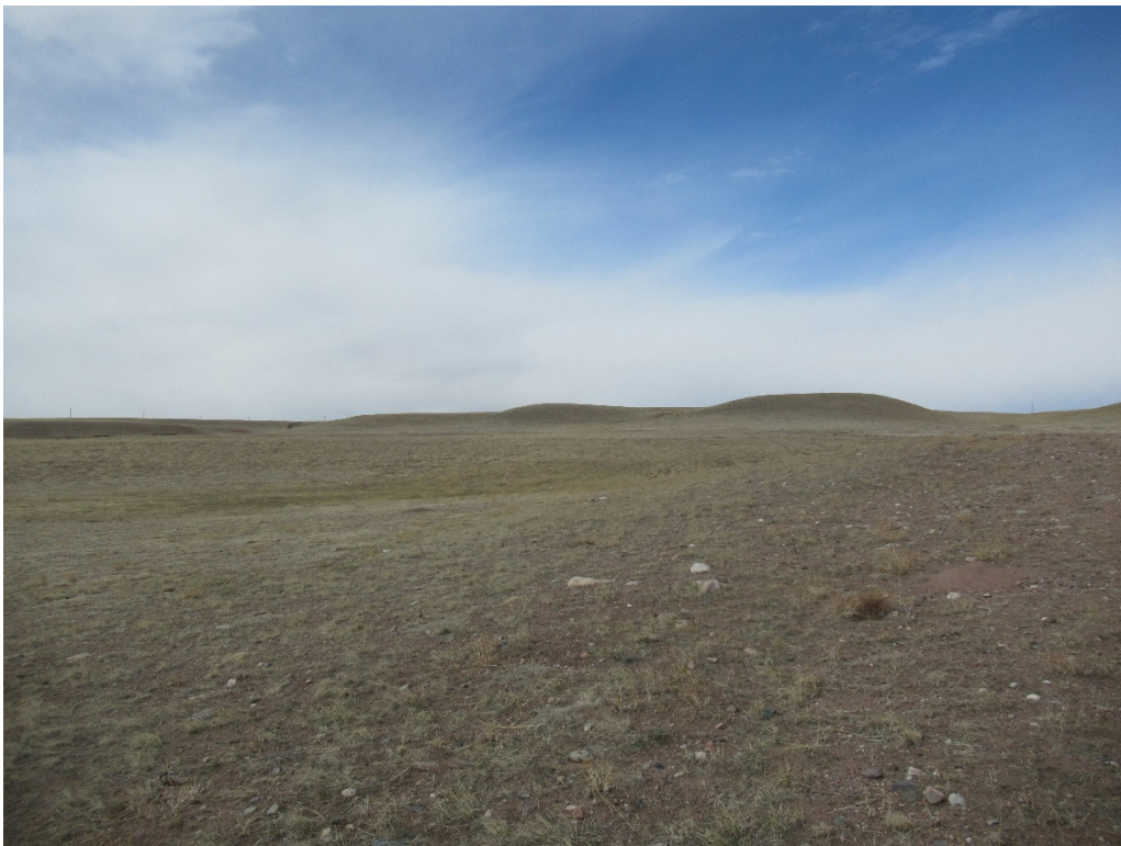
View of the northern portion of the site looking west