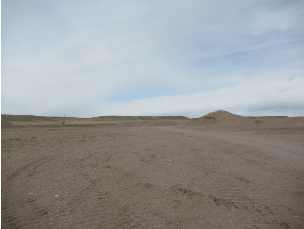
View of the stockpiles located in the middle of the site