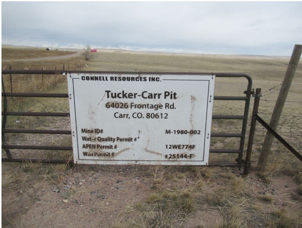
Tucker Pit mine sign