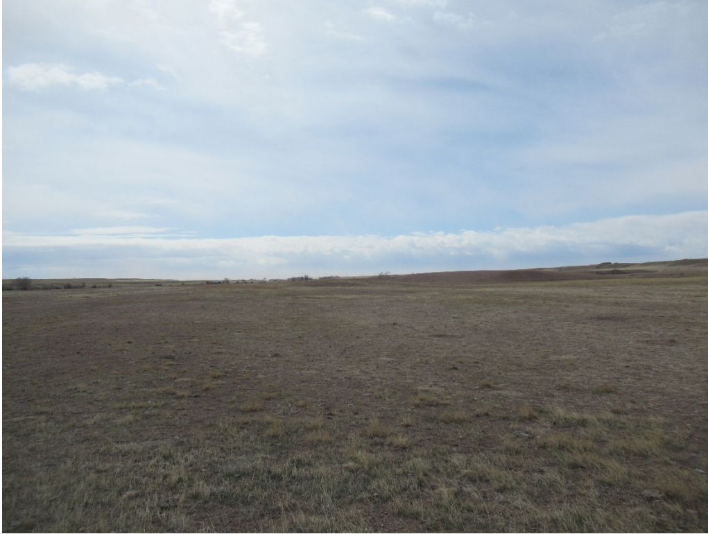
View of the northern portion of the site looking south