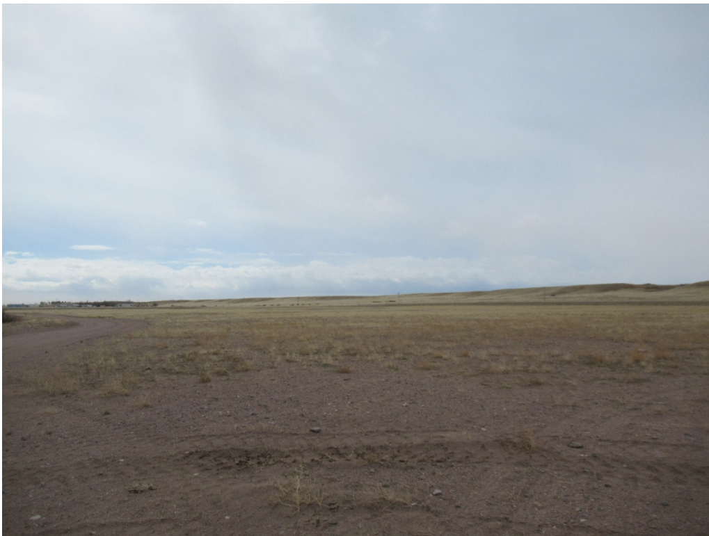
View of the southern portion of the site looking south