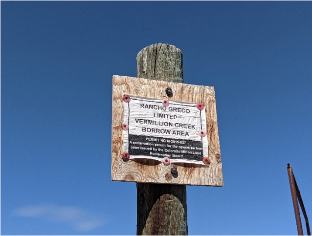
Mine identification sign.