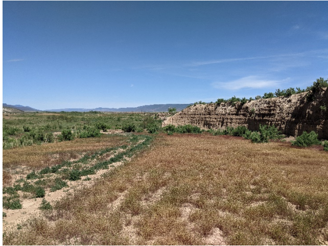
Highwall in eastern region.