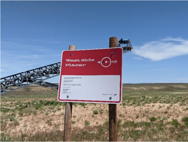
Mine identification sign.