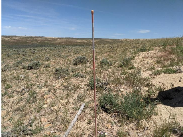
Affected boundary marker.