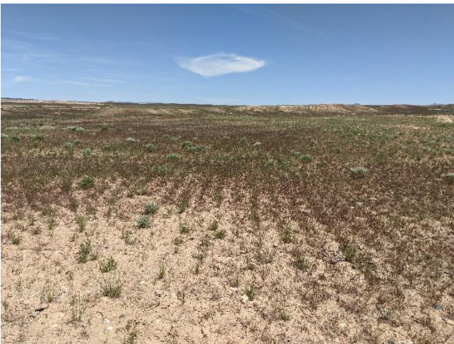
Reclamation along northern end of permit.