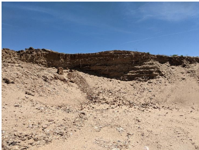
Current pit excavation.