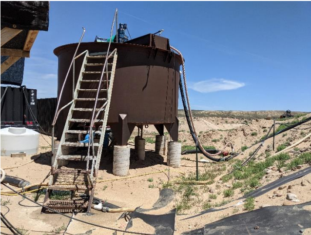
Flocculant mixing tank.