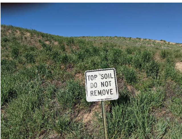
Topsoil pile and signage.