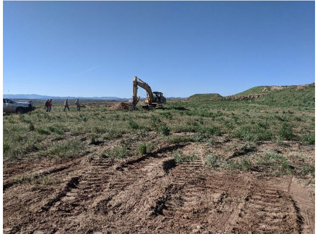
Active test holes being dug.