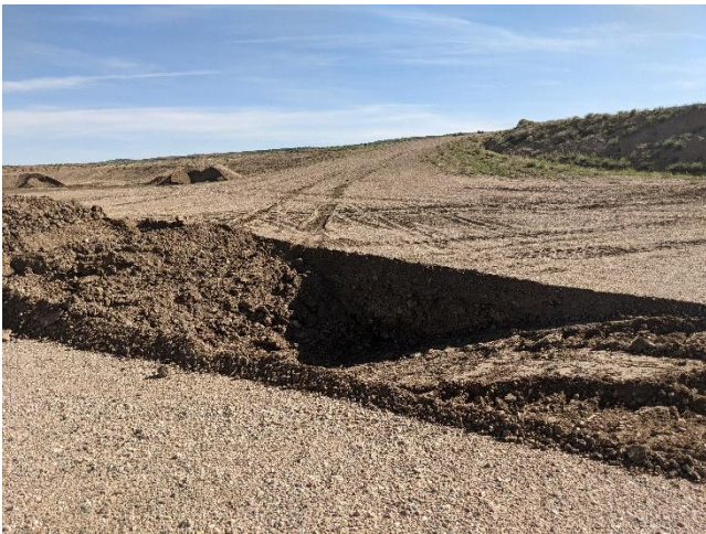
In-pit test holes.