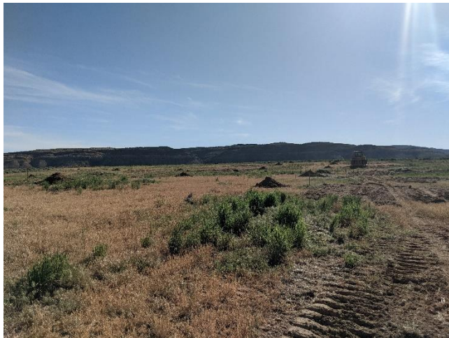
Test holes north of pit.