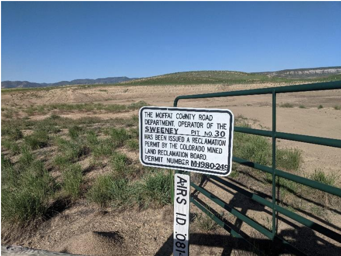
Mine identification sign.