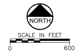
FIGURE 1 IDARADO MINING COMPANY PANDORA PERMIT BOUNDARIES