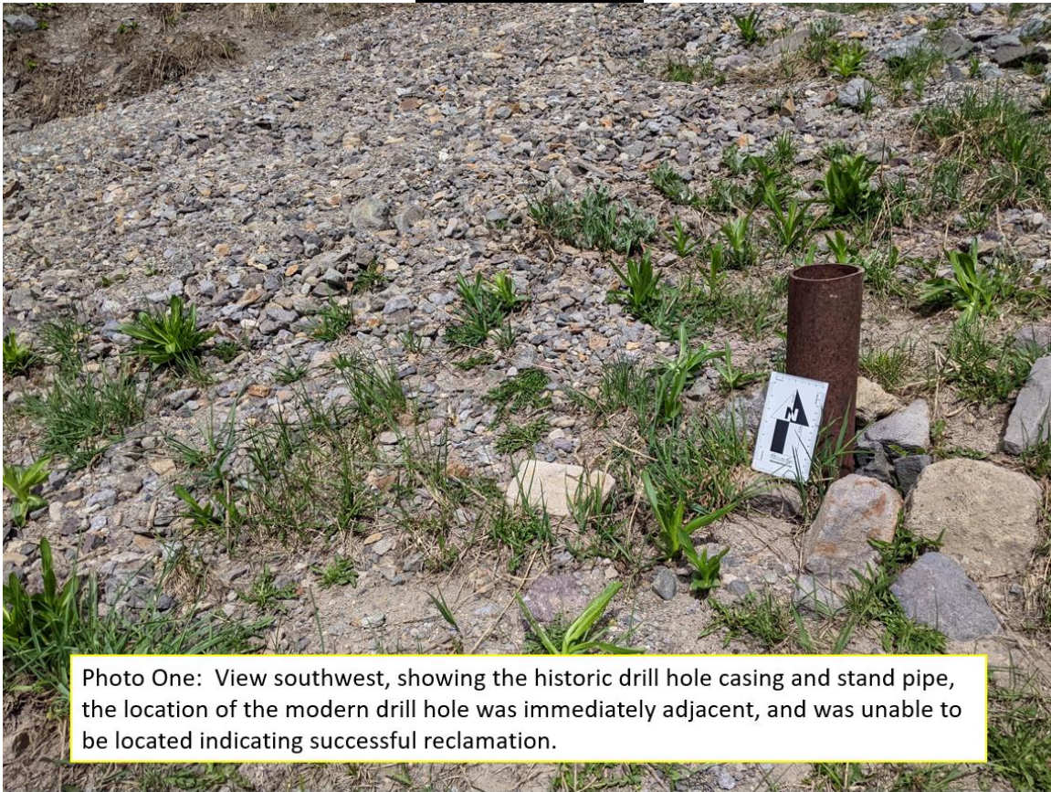
Photo One: View southwest, showing the historic drill hole casing and stand pipe, the location of the modern drill hole was immediately adjacent, and was unable to be located indicating successful reclamation.